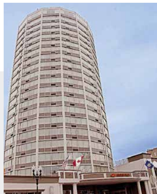
Crowne Plaza Syracuse Hotel, Syracuse, NY, USA

million to the Group's revenue, an increase of HK$1.6 million or 6.7%, from HK$24.0 million in FY2012. The increase in revenue was offset by increased administrative expenses and interest expense arising from a bank loan to re-finance its joint operation of the Hotel in April 2013. Accordingly, the profit contribution reduced slightly to HK$3.7 million in FY2013 from HK$3.8 million in FY2012.