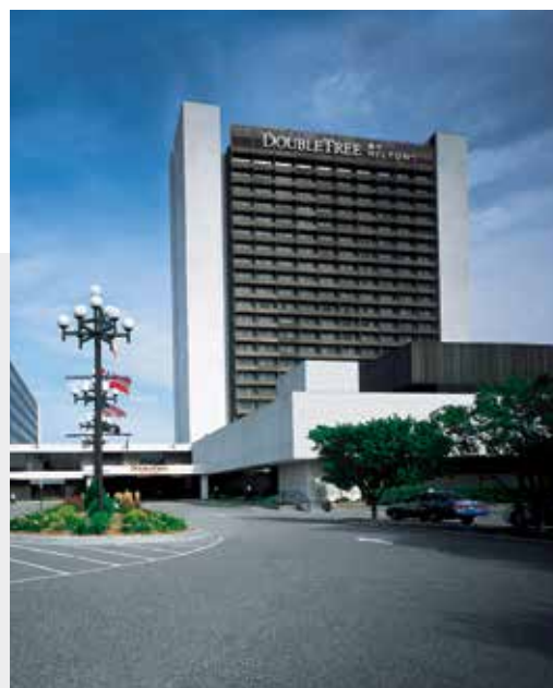
DoubleTree by Hilton Bloomington, Bloomington, MN, USA

Overall, HK$33.0 million net cash was used which, together with a favourable exchange translation gain of HK$3.3 million, resulted in a total Group's cash and cash equivalents of HK$346.7 million as at 31 December 2013, down from HK$376.4 million as at 31 December 2012.