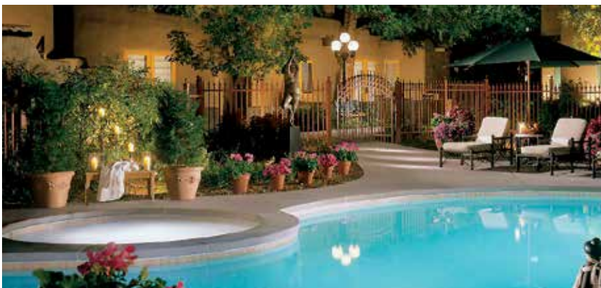
La Posada de Santa Fe Resort & Spa, Santa Fe, NM, USA

Sceptre is the hospitality industry's leading expert for reservations connectivity, online channel marketing and revenue/channel-management services. By increasing exposure of its client hotels throughout the various electronic channels such as the global distribution systems (GDS), the Internet and property direct sources, as well as optimising its vast channel-marketing reach, Sceptre helps hotels