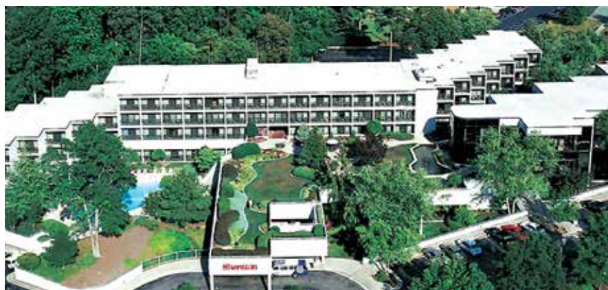
Sheraton Chapel Hill, Chapel Hill, NC, USA

Source delivers purchasing and procurement services to hotels with a focus on delivering lower operating expenses to hotels. Source offers hoteliers significant cost savings through its extensive number of national account agreements which are organised to support specific areas of need such as Food and Beverage, Rooms Operations, Engineering and Energy, Administrative, Furnishings, and Fixtures and Equipment.