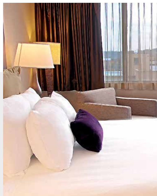
Crowne Plaza Syracuse Hotel, Syracuse, NY, USA

Richfield Hospitality, Inc ("RHI"), the Group's hotel management arm recorded a higher management fee of HK$33.0 million, an increase of HK$2.6 million or 8.6% from HK$30.4 million in FY2012. With good cost controls and measures, RHI contributed a lower loss before tax of HK$1.0 million as compared with a loss of HK$5.4 million in FY2012.