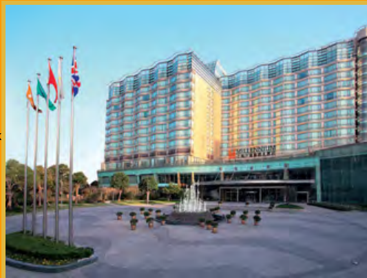
Millennium Hongqiao Shanghai

Quote Promo Code "SPRING" for your reservation or Book HERE .