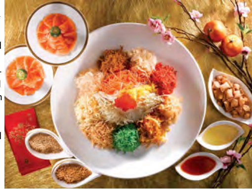
Prosperity Yu Sheng with Norwegian Salmon

The exclusive a la carte menu features traditional favourites like Fortune Barbecue Platter containing classics such as crispy Suckling Pig, Fragrant Roasted Duck, Barbecued Pork Glazed in Honey and Marinated Jelly Fish. The Lobster with Elm Fungus and Asparagus, Crispy Roasted Chicken with Truffles and Crispy Scallop Roll with Mango are not to be missed either.