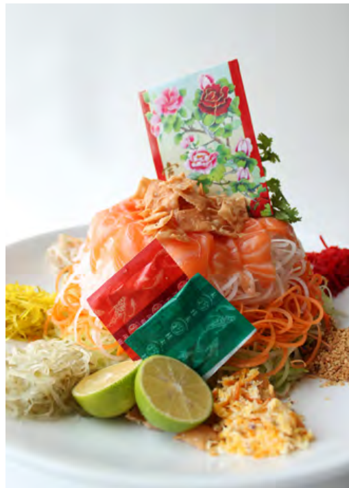
Fa Cai Yu Sheng