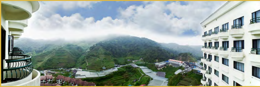
Perched at the peak of the highlands, Copthorne Hotel Cameron Highlands offers a spectacular view of the valley.

From 1 January 2014, Equatorial Cameron Highlands will be rebranded as Copthorne Hotel Cameron Highlands. Spread across 13 acres, the Tudor-styled resort offers 141 attractive, self-contained low rise apartment suites, as well as 268 superior rooms, deluxe rooms and suites in the hotel tower - all with breathtaking views of the surrounding highlands.