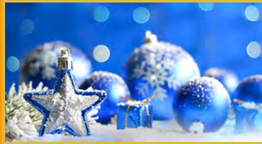
Enjoy up to 40% off with Festive Merriments in Asia