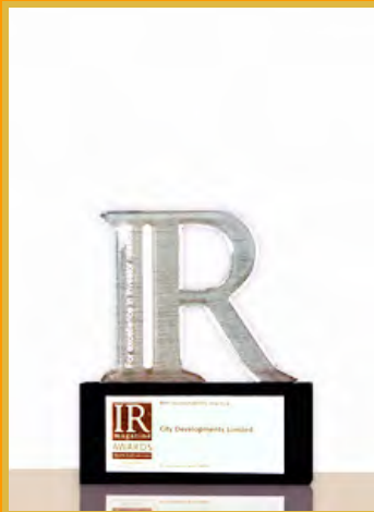
Inaugural winner of the Best Sustainability Practice category at the IR Magazine Awards – South East Asia 2013.