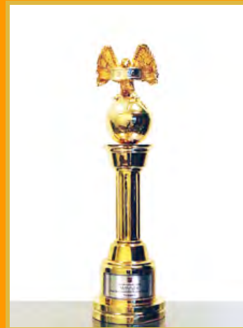
Best Sustainability Report in Singapore at The National Center for Sustainability Reporting's (NCSR) 9th Indonesia Sustainability Reporting Awards.

The Eco-Green Outstanding Leadership Award acknowledges companies who have demonstrated excellence in establishing successful businesses while engaging in best business practices such as Corporate Social Responsibility (CSR) through sustainable efforts.