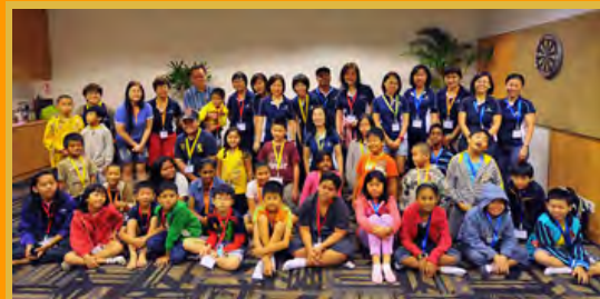
CDL staff volunteers and beneficiaries at C-Base, CDL's staff activity lounge.