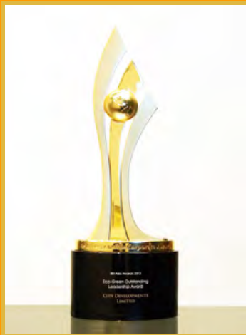
Eco-Green Outstanding Leadership Award at the Asia Responsible Corporate Awards – the highest tier of the Singapore's Built Environment Industry (BEI) Asia Awards.

As testament to its green building leadership and conviction to responsible business practices, CDL added three more feathers to its cap last December.