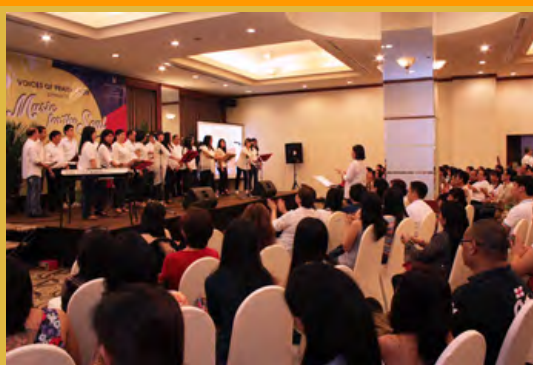
The Voices of Praise choir entertained the audience with a medley of 13 soothing songs, all of which inspired the spirit of oneness and brotherhood.