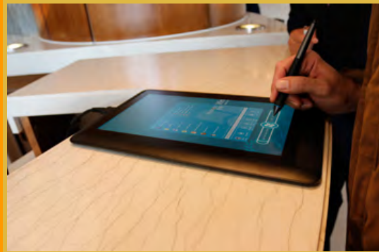
Not only does the e-signature system reduce a considerable amount of paperwork but it also adds an extra layer of security for guests.

Millennium HongQiao Hotel Shanghai is taking more steps to go green with the implementation of its new e-signature check-in and out system.