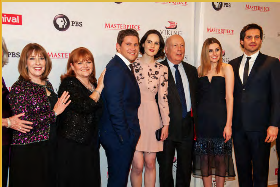
The cast of critically acclaimed television series, Downton Abbey was recently at Hudson Theater for the North American media launch of Season Four.