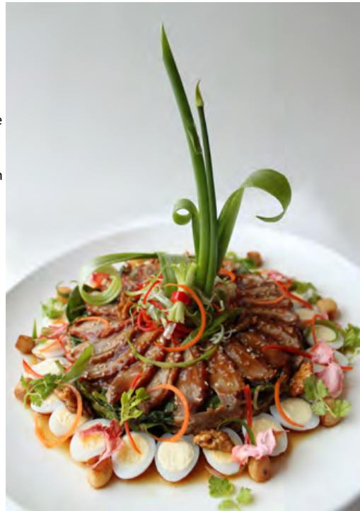
Singapore Roasted Duck with Spinach, Bean Sprout, Hoi Sin sauce

For reservations, call +65 6233 1100 or email dining.gcw@millenniumhotels.com Please book early to avoid disappointment.