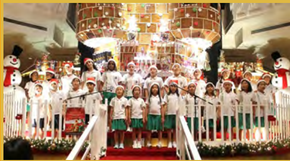
Christmas carols filled the air as the children's choir from Garden International School sang to hotel guests in front of the Gingerbread Castle at Grand Millennium Kuala Lumpur.

Grand Millennium Kuala Lumpur launched its annual "Star for A Child" Campaign and Christmas tree lighting ceremony on 5 December 2013. The event was officiated by Ambassador of Finland, Matti Pullinen and was made even more memorable with the rendition of Christmas carols by children of Garden International School.