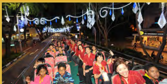
Beneficiaries enjoying the festive sights along Orchard Road accompanied by CDL staff volunteers.

The camp was tied to 'TOUCH Movie Nite' where CDL sponsored movie tickets to treat the children to a screening of Walt Disney's "Frozen", in advance of the movie's worldwide release. After the movie, the children hopped on to the HiPPo bus for an exciting tour of the annual Orchard Road festive light-up. A morning walk from City House to Marina Bay Sands was planned but unfortunately, it could not materialise due to rain. The children were occupied with alternative activities such as quizzes and games which they took part in with great zeal and fun.