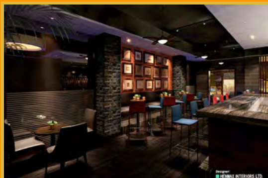
Beijing Riviera members can look forward to some exciting new features at the club in 2014 like a new Jamaica Blue café and a fresh look for the Polo Bar.