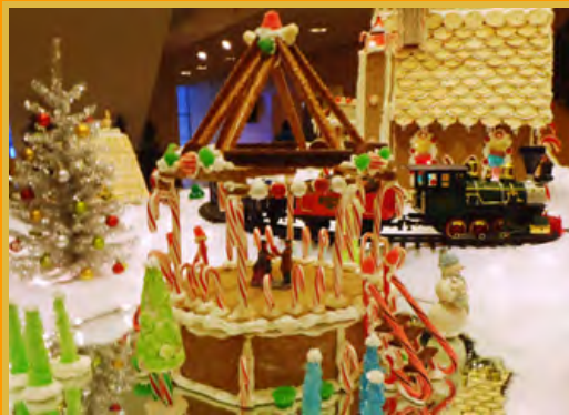
The traditional Gingerbread town in the lobby of Millennium Cincinnati was a welcome delight for hotel guests and families.

Adding a little traditional Christmas décor to the lobby, Millennium Cincinnati built a Gingerbread town that took about 15 hours to complete.