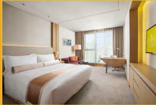
Book into the Millennium Vee Taichung this Lunar New Year

Quote Promo Code "LNY" for your reservation or Book HERE .