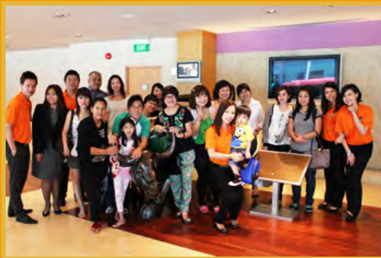
M Hotel's Sales & Marketing Team with their clients and families.

It is never only about business at M Hotel Singapore. The hotel recently organised a 3 day 2 night trip to Kuala Lumpur for its top clients. Some of the clients came with their families and it was a fun and fulfilling trip which enabled the hotel's Sales & Marketing Team to foster stronger client relationships.