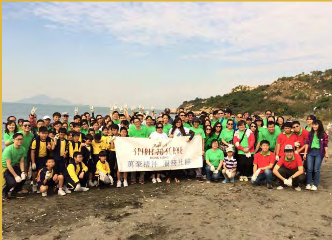
Volunteers from JW Marriott pose with the rest of the team from the Hong Kong Business Council. They were joined by volunteers from Hong Chi Association and children from Fresh Fish Traders' School.

JW Marriott Hong Kong recently took part in a Coastal Cleanup campaign as part of a team of companies from the Hong Kong Business Council. The hotel, along with staff volunteers from Renaissance Harbour View, SkyCity Marriott and Courtyard participated in the cleanup effort on 23 November at the Lung Kwu Tan neighbourhood in the Tuen Mun district. The event aims to generate public awareness and responsibility in protecting the marine environment. Over 130 associates, together with volunteers from Hong Chi Association and children from Fresh Fish Traders' School, participated in the meaningful event collecting a total of 340kg of garbage along the coastal strip.