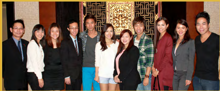
The Copthorne King's Hotel Singapore team with the cast of "Spouse for House". The cast was at the hotel to film a scene for the upcoming sitcom which is due to air in Singapore on Channel 5, February 4.