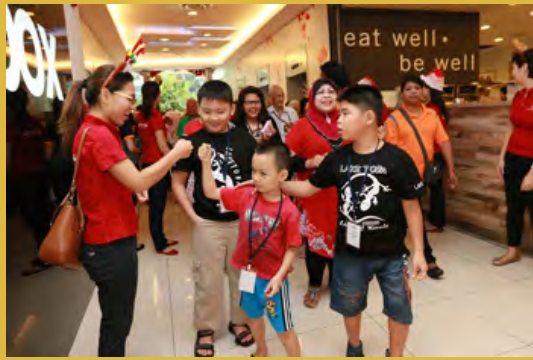
The beneficiaries enjoy a light-hearted moment with CDL volunteers at the Christmas celebration.

The residents enjoyed a sumptuous dinner, a magic show and ballet performances, and received goody bags. The evening ended on a magical note with an open-top HiPPo bus ride that enabled them to take in the festive sights of the Christmas light-up.