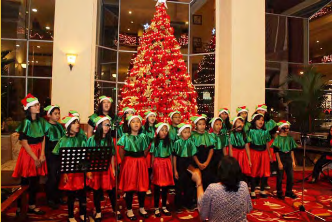
Student performers from the Ora et Labora Children Choir singing Christmas Carols at the hotel lobby.

As part of its Christmas celebrations, Millennium Hotel Sirih Jakarta collaborated with Ora et Labora Children Choir (OeLCC) from Ora et Labora School to organise a Christmas Carol session at the hotel's lobby from 17 to 19 December at 7 pm. The choir consisted of 20 students from elementary to junior high school and they performed more than 30 Christmas carols over the three days. The choir members also added to the festivities by handing out chocolates and candies to some guests when they checked in.