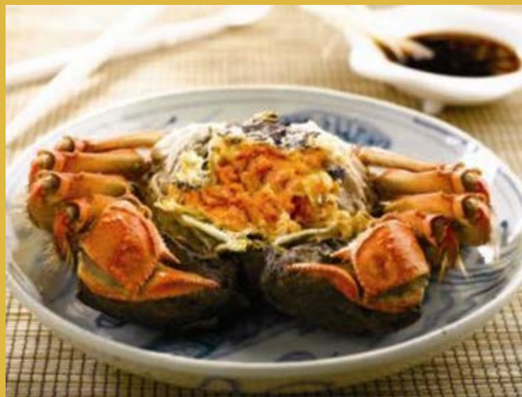
Steamed Whole Hairy Crab is known for its lusciously sweet and delicate meat.

For enquiries and reservations, please call Yan Ting at +65 6506 6887 or email yanting@stregis.com . For more information, please visit yantingrestaurant.com/hairycrab .