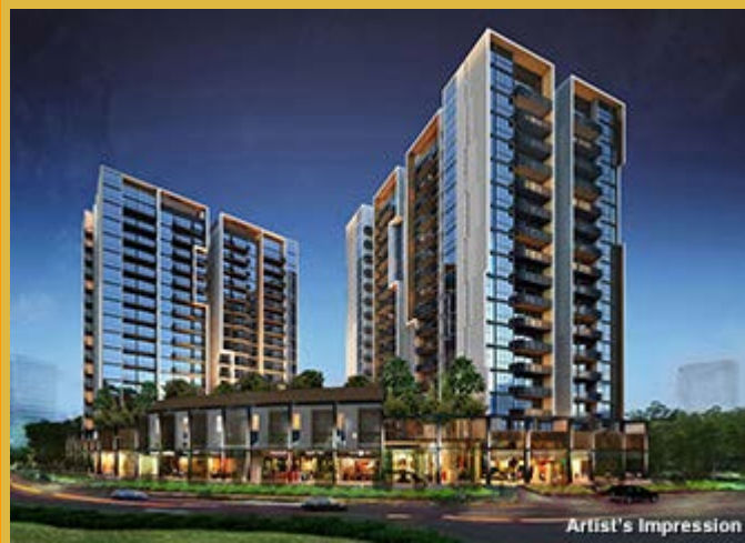
The Venue Residences And Shoppes is just a 3-minute walk to Potong Pasir MRT station.