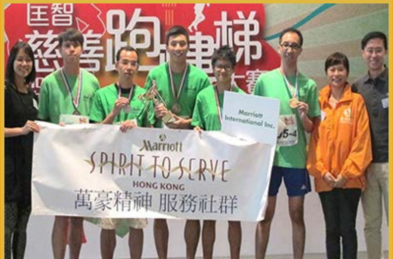
The associates from JW Marriott that took part in the Hong Chi Climbathon 2013.

A total of HK$38,869 was raised by the Marriott International Hotels Hong Kong. The donations will be used to support the Hong Chi Association for their continuous development on training and rehabilitation services for people with intellectual disabilities.