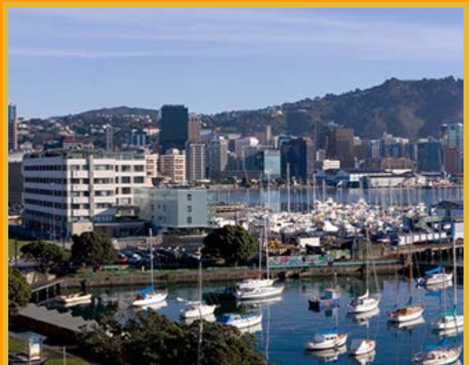
Copthorne Hotel Wellington Oriental Bay