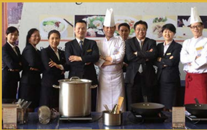
Millennium Harbourview Hotel Xiamen's team at the Millennium Vegetarian Delicatessen Counter.

The Millennium Harbourview Hotel Xiamen has once again showcased its high standards in food & beverage and service by catering for the 2013 Xiamen International Buddhist Items and Crafts Fair. This opportunity was the result of the hotel's long-term official partnership with the Xiamen International Exhibition Center, the venue for the fair. Held from October 10-13, the Xiamen Buddhist Items and Crafts Fair 2013 was touted as one of the largest Buddhist exhibitions in the world. The hotel had set up the Millennium Vegetarian Delicatessen Counter inside the exhibition hall during the fair and provided dining services and beverages for exhibitors and visitors.