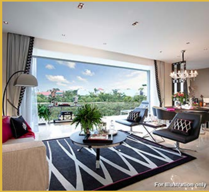
The Glyndebourne – a Lifestyle of Distinction.

At the South East Asia Property Awards (SEAPA), a glamorous affair held at the Shangri-La Hotel Singapore on 31 October 2013, City Developments Limited (CDL) was conferred the prestigious Best Developer (Singapore) Award.