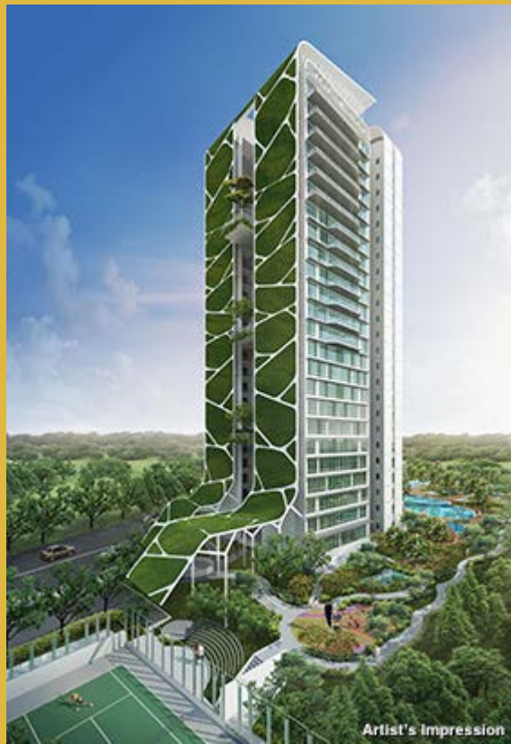
The 24-storey-tall green wall is a key feature of the Tree House development.

Tree House, a joint venture project between City Developments Limited (CDL) and Hong Realty (Private) Limited, has garnered the Special Award (Best Design for Maintenance) at the Skyrise Greenery Awards 2013, organised by the National Parks Board (NParks).