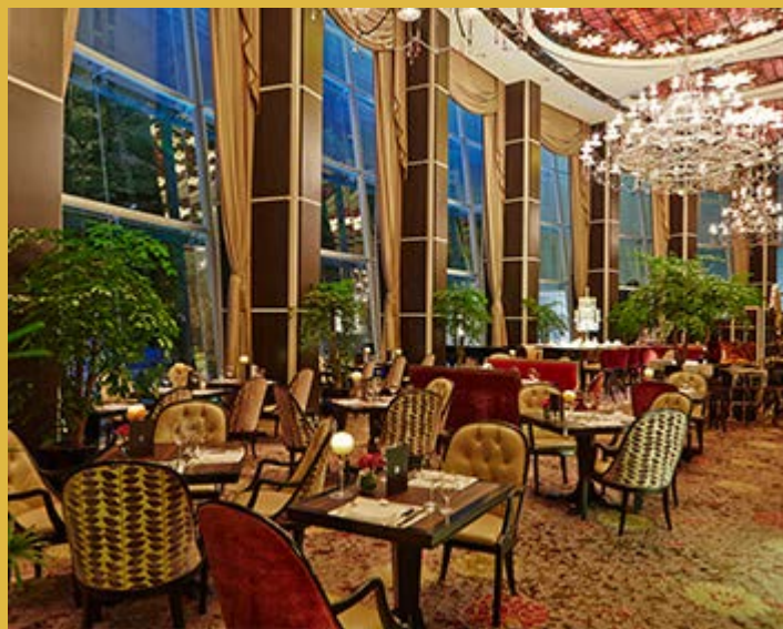
Enjoy a sumptuous Thanksgiving spread at Brasserie Les Saveurs.

Partake in this meaningful occasion to reflect on the year's successes with friends and cherished ones, amidst a traditional Thanksgiving spread of specially-crafted savouries at Brasserie Les Saveurs.