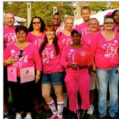
Millennium Cincinnati Strides For Breast Cancer