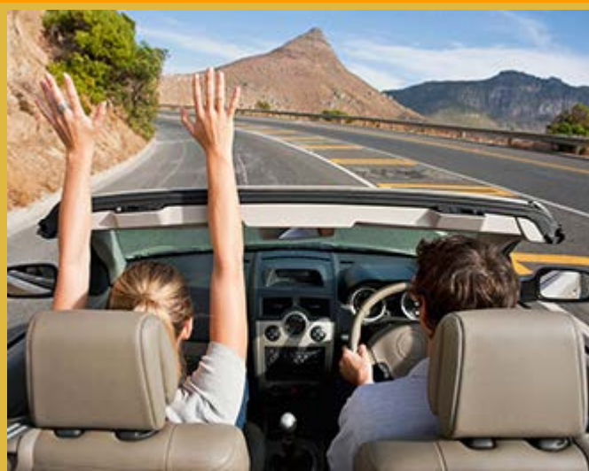
M&C loyalty members enjoy peace of mind with Hertz All-Inclusive Package

Quote Promo Code CDP "2004721" for your reservation or log on to http://link.hertz.com/link.html?id=35231&LinkType=HZSG to book now.