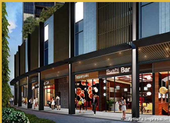
All retail units are located on the ground floor with great visibility and direct access from street level.

The Venue Residences And Shoppes Sales Gallery is open from 10.30am to 7.00pm on weekdays, and from 9.30am to 7.00pm on weekends. For sales enquiries, please call the sales hotline: 6287 2922.