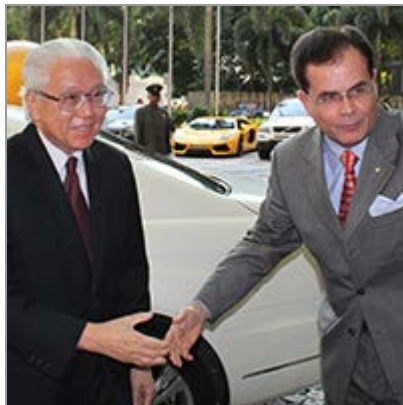
Singapore President Tony Tan At Grand Copthorne Waterfront