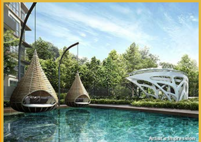
Facilities will include a social pool with hanging loungers, 50-metre lap pool, spa pool, sunken tennis court, jogging track and an aqua gym.