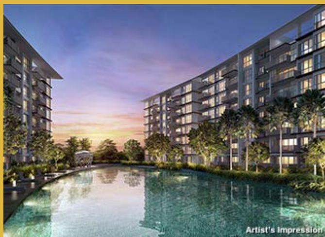
The InFlora is set in resort-style surroundings and lush greenery, embracing natural elements in its design.

Expected TOP for the development is 31 March 2017.