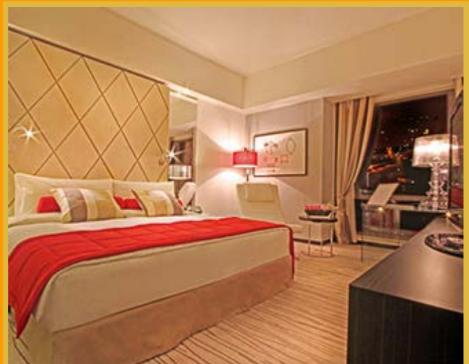
Standard Room with king-sized bed at the Millennium Hotel Amman