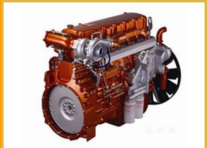
CYI produces a range of heavy-duty diesel and gas engines, including the new 6-cylinder National IV and V compliant YC6K Engine.

Beifang will hold 15% of the new joint venture entity with the remaining 85% interest held between BeiBen, GYMCL and Y&C Engine.