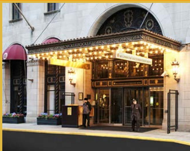
Millennium Knickerbocker Hotel Chicago