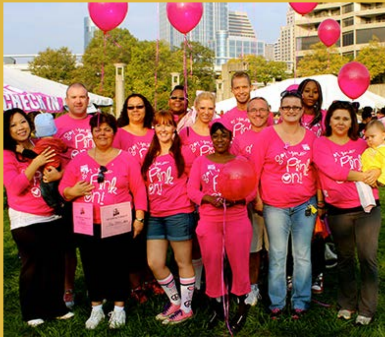
The team of Millennium Cincinnati with staff, friends and family, collected US$5,140.50 in the fight against breast cancer.

Millennium Cincinnati participated in Making Strides Against Breast Cancer with a total of 29 staff, friends and family. Together they raised US$5,140.50, placing the hotel in third place (out of 685 teams city-wide) for its fundraising efforts.