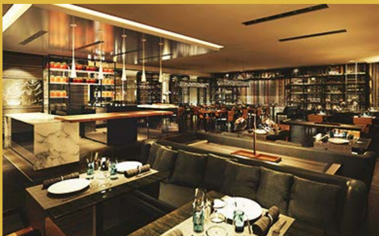
JW Marriott Hotel Hong Kong's newest F&B establishment; Flint Grill & Bar

JW Marriott Hotel Hong Kong has unveiled its latest dining concept, Flint Grill & Bar. Located on level 5, Flint Grill & Bar offers an exceptional dining experience in a cutting-edge industrial chic setting, serving quality grills and modern classic dishes, expertly prepared with delicious home-made recipes and imported market fresh ingredients. Signature dishes include Nebraska 63 days dry-aged on the bone, and Six Point Berkshire Black Pork Chop, with crusted fennel seed and apple compote. The restaurant also features an array of iconic cocktails, specialty drinks and premium wines.