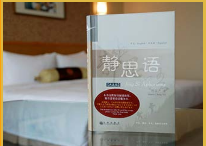
Guests of Millennium Harbourview Hotel Xiamen have commented that "Jing Si Aphorisms" – a book on Buddhist teachings, is an inspiring and enjoyable read.