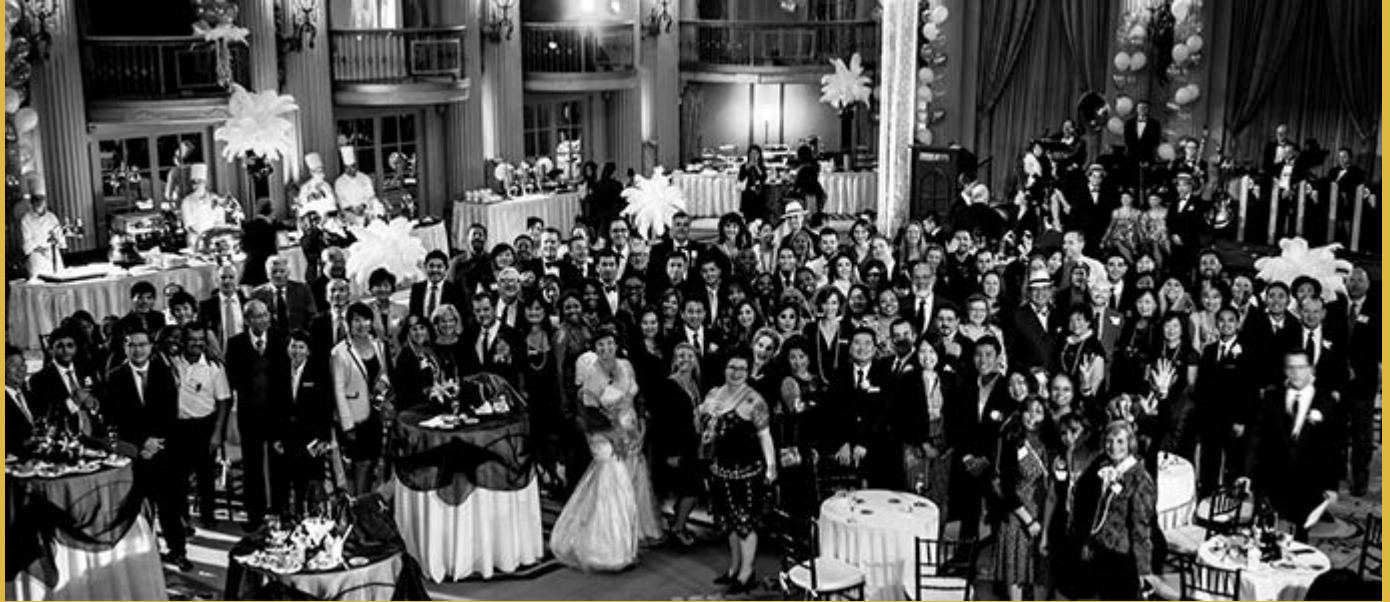
Top customers and senior management attended the Gatsby-themed Client Appreciation Gala to celebrate Millennium Biltmore's 90 th Anniversary.