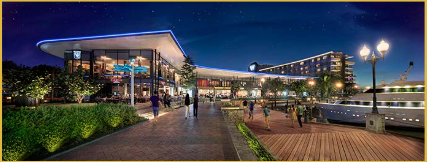
Quayside Isle came in “Highly Commended” in the Best Commercial Architectural Design category.

The SEAPA is organised by Ensign Media, the publisher of Asia’s monthly leading luxury real estate magazine Property Report and the quarterly supplement, Helm Superyacht Lifestyle.