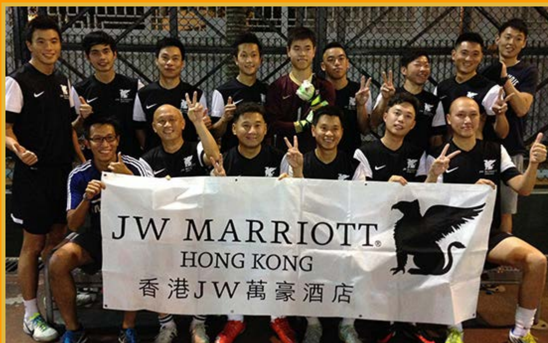
The soccer team from JW Marriott.

The Hong Kong Hotel Association's annual seven-a-side Soccer Tournament kicked off in early October with its first round of matches on October 10. A team from JW Marriott Hotel Hong Kong, consisting of 14 associates, was pitted against the team from Hyatt Regency Hong Kong. The game, which was held at Moreton Terrace in Causeway Bay, was an exciting one from start to finish. Although this was the first time the hotel was taking part in this competition, the JW Marriott team emerged victorious with a score of 4-1, with all team members demonstrating great skill, sportsmanship and team spirit.