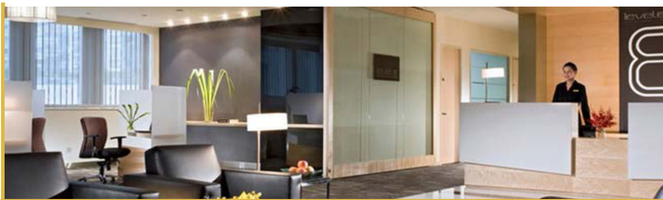
M Hotel Singapore has 32 fully furnished designer office suites complete with modern business and IT facilities on Level 8.

The TPP Ministerial Meeting entailed meticulous planning and attention to detail on a very tight timeline. The event was executed with precision and delivered with utmost attention to provide the highest level of service excellence. This included elaborate security and daily dietary planning to VIP accommodation assignment.