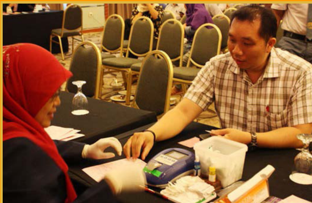
Millennium Sirih Jakarta celebrated its 20th anniversary with a Blood Donation drive (pictured above) together with the Indonesian Red Cross. More than 160 people including hotel staff and the public participated in the event. Lunch and coffee was provided to all who donated their blood, as well as a mug as part of the hotel's anniversary celebrations.