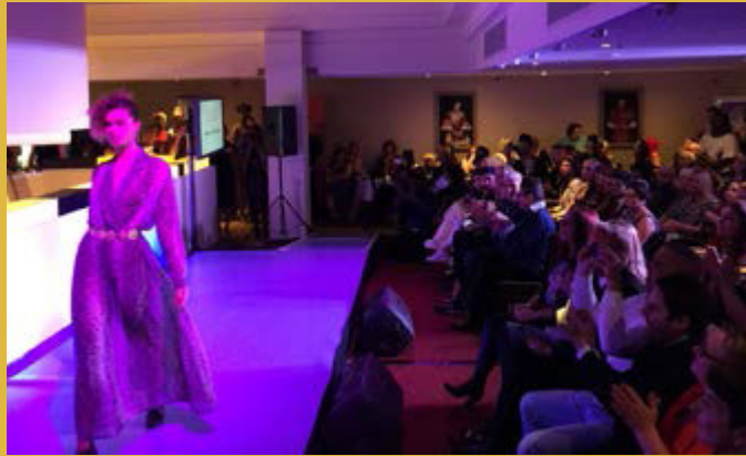
Held at Millennium Knightsbridge's Le Chinois Restaurant, the Wear It For Autism 2014 Charity Fashion Show drew several celebrities and well known fashion designers to the event.

Millennium London Knightsbridge recently hosted the Wear It For Autism 2014 Charity Fashion Show to help raise awareness and funds for the organisation, Wear It For Autism.