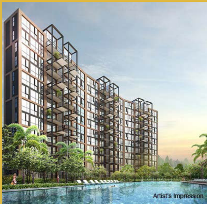
CDL's 636-unit EC development at Canberra Drive will utilise some 3,300 prefab building modules in its construction – possibly the world's largest application of PPVC for a large-scale residential project.

practices, CDL has continuously explored using sustainable designs and construction technologies to develop buildings in a productive, safer, and eco-friendly manner. The extensive use of PPVC for this EC project is ideal due to its modularity of units, which we have embraced from the design stage.