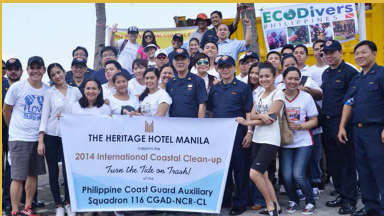
Staff and management from Heritage Hotel Manila participated in the International Coastal Cleanup event, and helped to pick up trash and various litter along the Manila Bay Coastline.