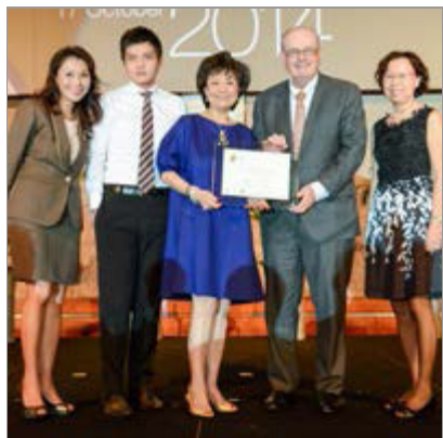
HLF Shines In Banking Service Excellence