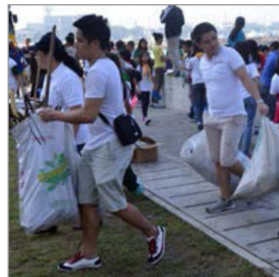
Clean Up At Manila Bay Coastline