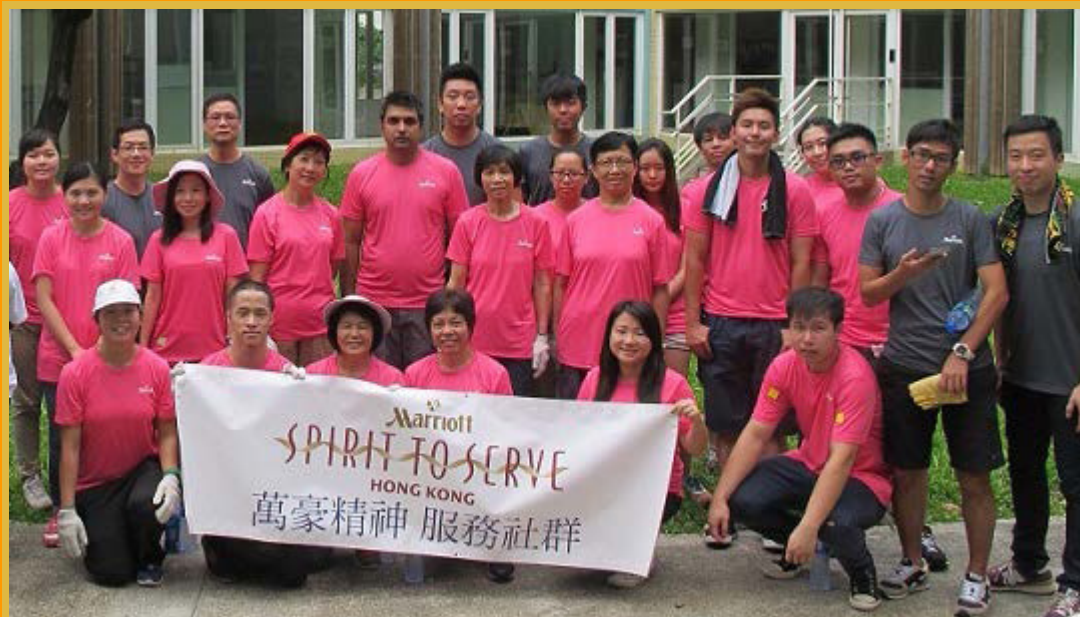
More than 42 staff associates from JW Marriott Hong Kong planted trees and mowed the lawn to help Hong Chi students learn about organic farming skills.

JW Marriott Hong Kong is a long-term supporter of Hong Chi Association, a non-profit organisation in Hong Kong that helps people intellectual disabilities. Below are some of their volunteering activities.