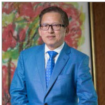
Kwek Leng Beng Best Travel Entrepreneur 2014