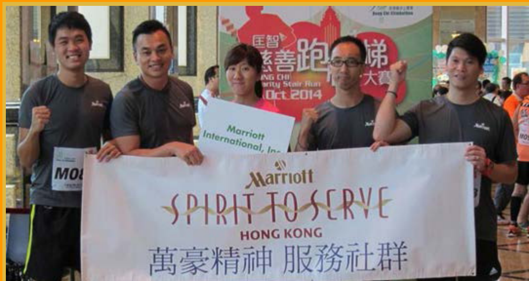
In this year's Hong Chi Climathon, individuals and relay teams are challenged to climb 1,688 steps or 75 floors of the Central Plaza, one of Hong Kong's tallest buildings. The "Marriott Power Team" completed the race in 9 minutes and 19 seconds, coming in 3rd runner up in the competition out of 21 teams. This is the 10th consecutive year that the Marriott Hong Kong hotels have participated in this event.