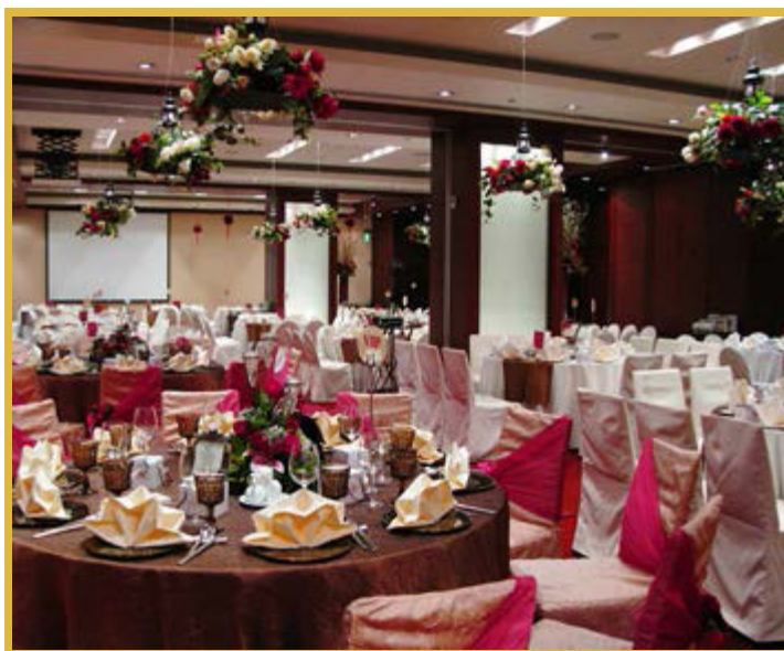
Copthorne King's Singapore has seven fully-equipped function rooms that can be easily configured to various meeting arrangements and wedding banquets.

More recently, Grand Copthorne Waterfront hosted the 3rd bi-annual Africa Singapore Business Forum 2014 which saw an attendance of more than 600 delegates across 25 countries. Nearly 200 of the delegates stayed at the hotel during the 2-day forum which similarly required precision in service and security. The 574-room Grand Copthorne Waterfront's refurbished Waterfront Conference Centre has 34 versatile meeting rooms covering 6,039 sqm including a ballroom of 853 sqm and seating up to 900 guests theatre-style.