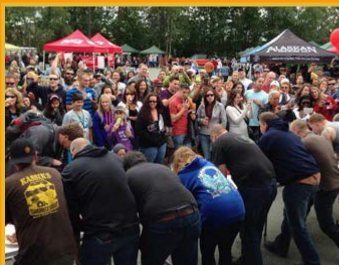
Bacon-eating contestants (left image) face off in front of more than 600 festival attendees and the local press (right image).

Millennium Alaskan Hotel Anchorage put together two of Alaska's favourite things for an end-of-summer celebration, and hosted the 2nd Annual Millennium Beer & Bacon Festival on the hotel grounds on the shore of Lake Spenard. The hotel partnered with 5 local breweries and 12 outside caterers to create the summer's most talked about event in town.