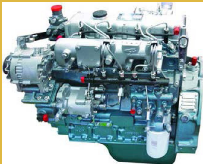
The first units of the four-cylinder, four-stroke engines have been supplied to transit buses in Shanghai.