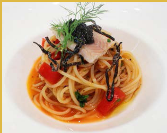
Pontini's new Italian menu is sure to tempt the taste buds of even the most seasoned connoisseur.

Starting 1 November 2014, Pontini's Chef Daniele Sarno will be wooing the discerning diner's palate with new creations such as home-cured Scottish salmon with green apple purée, fennel and glacier salad with aged balsamic vinegar pearls, grilled Mediterranean blue fin tuna steak, baby vegetables salad, Italian corn lettuce and apple balsamic vinegar, cold capellini in tomato fondue, smoked eel, caviar and chives, and Chitarra pasta with Mediterranean octopus ragout, roasted tomatoes sauce and parsley.