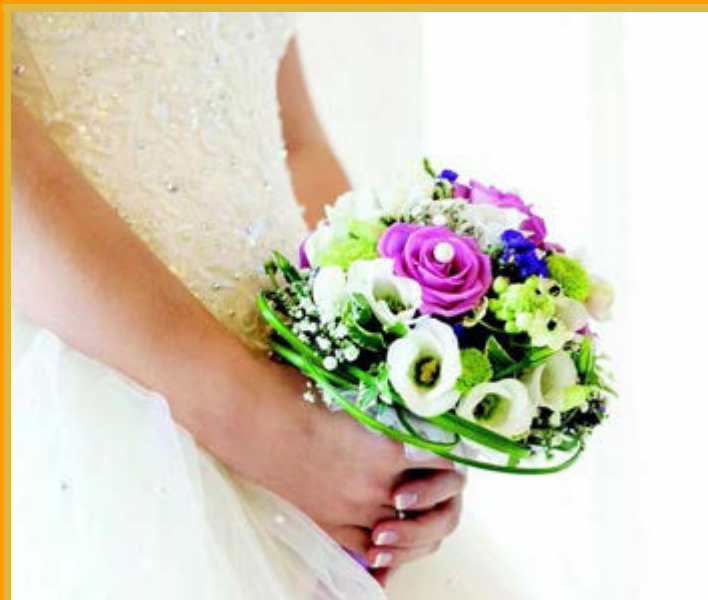
Come to Copthorne King's as it celebrates a Journey of Love with its wedding workshop.

For enquiries and registration, please call (65) 6318 3116 or email catering.cks@millenniumhotels.com .