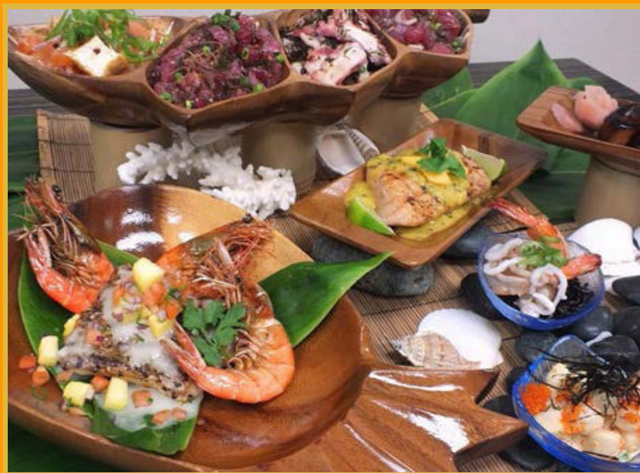
An authentic Hawaiian spread awaits at The Lounge at JW Marriott Hotel Hong Kong

The Lounge at JW Marriott Hotel Hong Kong is presenting delicious Hawaiian fare to the sumptuous buffet menus for supper and Sunday brunch, from 13 to 22 November 2014.