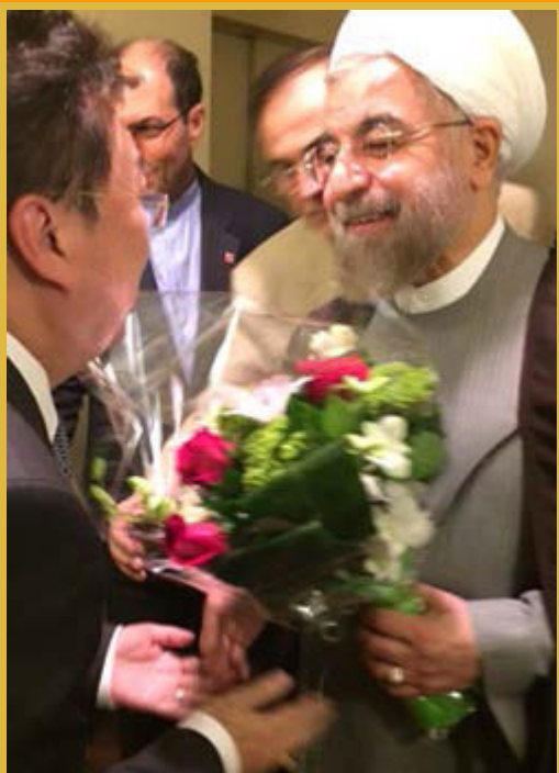
Paul Wong with the President of Iran Hassan Rouhani (right) during UNGA.

ONE UN New York with a name inspired by the hotel's illustrious neighbour, and physical address at One United Nations Plaza took center stage during the 69th session of the United Nations General Assembly (UNGA) from September 21 – 27.