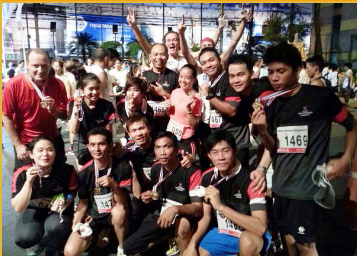
More than 20 staff and management from Grand Millennium Sukhumvit participated in Bangkok's largest 17th Annual Charity Midnight Run. Hosted by BMW Thailand and Amari Watergate hotel, more than 7,000 international and local professional runners participated in the midnight event which gave them a choice of either the 6 or 12-kilometer routes.