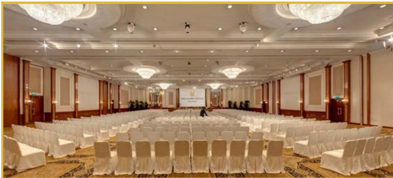
The 1,245 sqm pillarless Grand Ballroom at Orchard Hotel Singapore, the largest among M&C's Singapore hotels, can be converted into three separate smaller ballrooms.

Asia's robust economic growth has resulted in a thriving Meetings, Incentive Travel, Conventions and Exhibitions (MICE) sector in Singapore. According to the Singapore Tourism Board, the Republic hosted 3.5 million business visitors last year, up 3 per cent from 2012. In 2013, the MICE business meant revenues of about S$5.5 billion (excluding sightseeing, entertainment and gaming expenditure) here.