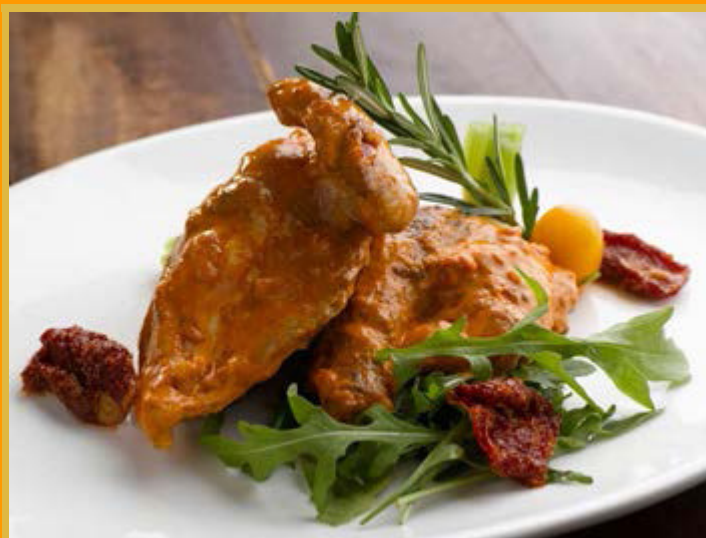
Treat your palate to Stewed Hungarian Baby Chicken from Eastern Europe this November at Starscafé.

For enquiries and reservations, please call 6318 3186 or email foodbev.cks@millenniumhotels.com .