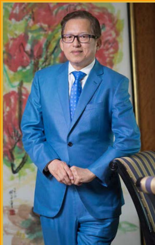
Under the leadership of M&C Chairman Mr. Kwek Leng Beng, M&C has expanded from one hotel in the 1970s to more than 120 hotels worldwide today.

The “Best Travel Entrepreneur of the Year” award is a new accolade that honours an individual who sets new standards for his organisation's brand and contributes to areas in the travel industry such as sustainability, training and education.