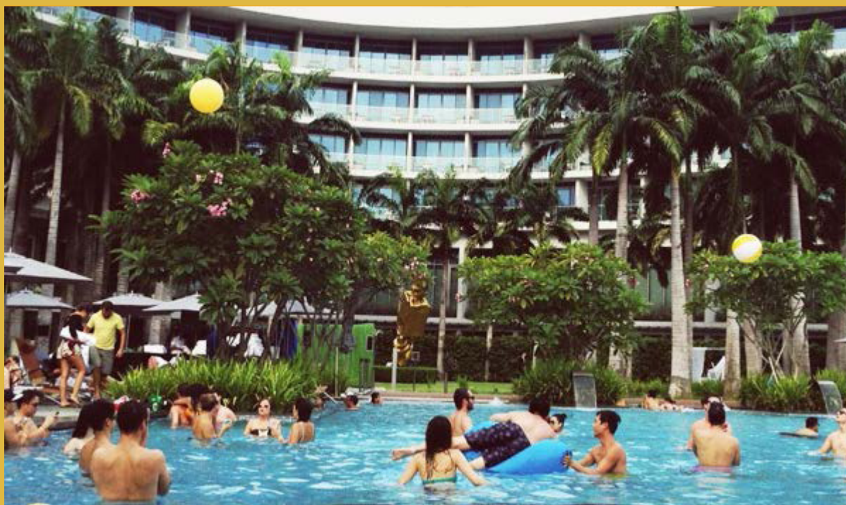
More than 200 guests enjoyed an afternoon of fun and water with cool beats and smooth cocktails.

A monthly pool extravaganza held at the Wet Pool Deck featured an afternoon of fun and good vibrations. With smooth tunes and extra beats fueling the day with dynamic rhythms by the hotel's resident DJ, more than 200 guests and customers relaxed and recharged by the poolside, and were pampered with nibbles, free Haagen Dazs ice cream, cocktails as well as the beverage of the month, Veuve Clicquot.