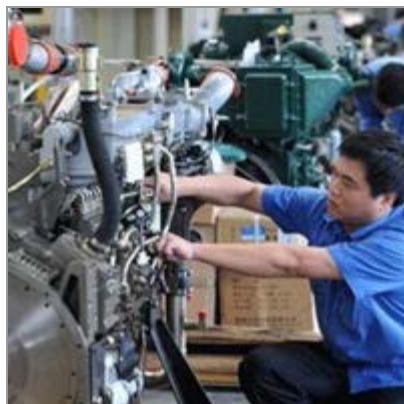
New China Yuchai Engines In Shanghai