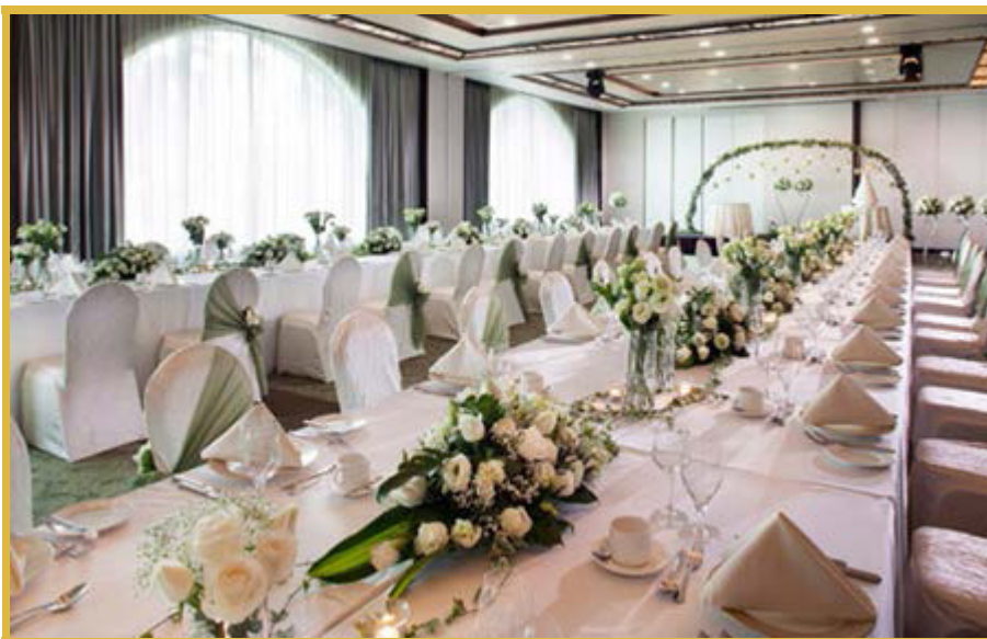
Grand Copthorne Waterfront has an adjoining Waterfront Conference Centre with 34 versatile meeting rooms covering 6,039 sqm, including a ballroom of 853 sqm and seating up to 900 guests theatre-style.

The steady increase in the number of MICE events here and the increase in the number of hotels have meant increased competition and greater demands. Organisers now look at one-stop facilities with professional conference sales and operations team. M&C Singapore hotels are competitively positioned as preferred MICE venues with a team of dedicated MICE professionals. All the group's hotels offer versatile well-equipped function rooms that have different characteristics to suit the needs of MICE event planners.