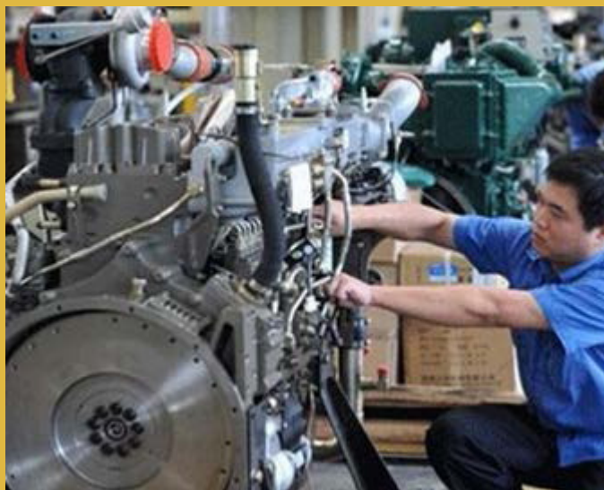
China Yuchai staff working on new YC4FA130-50 light-duty diesel engines that are compliant with National V emissions standards in Beijing and Shanghai.

The new engines are to be used in the model SXC6720G5 transit buses produced by Shanghai Wanxiang Automobile Co., Ltd. Shanghai Wanxiang designs, manufactures and sells transit, tour, electric and hybrid buses with an annual capacity of approximately 5000 units. Beginning in 2006, Shanghai Wanxiang entered into a joint venture with Zyle Daewoo Bus Corp., a bus manufacturer headquartered in South Korea, to build advanced buses.