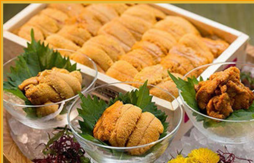
Enjoy a variety of tantalising sea urchin dishes at Sagano of New World Millennium Hong Kong Hotel.

This November and December, discerning diners are invited to immerse themselves in a variety of tantalising sea urchin dishes at Sagano of New World Millennium Hong Kong Hotel.