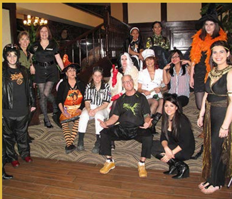
Staff at Millennium Alaskan Hotel donned their spookiest costumes.