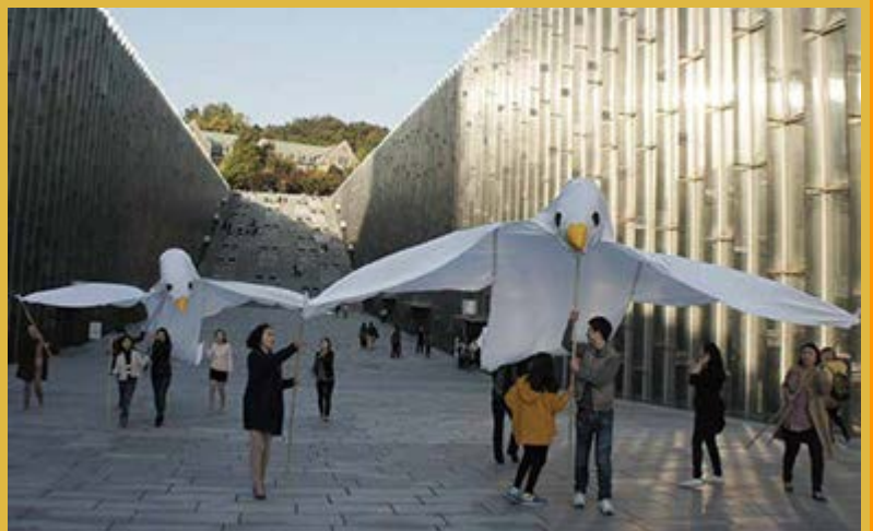
Celebrating International Day of Peace, students walked the grounds of Ewha Womans University with giant dove puppets made from used bed sheets donated by Millennium Seoul Hilton.

International Day of Peace promotes world peace through the absence of war and violence. First celebrated in 1982, September 21 is now observed annually as the International Day of Peace after the UN General Assembly passed a resolution in 1981 to devote this day to commemorating and strengthening the ideals of peace.