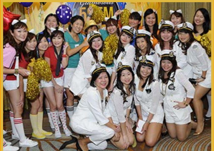
CDL staff in high spirits during the celebration.