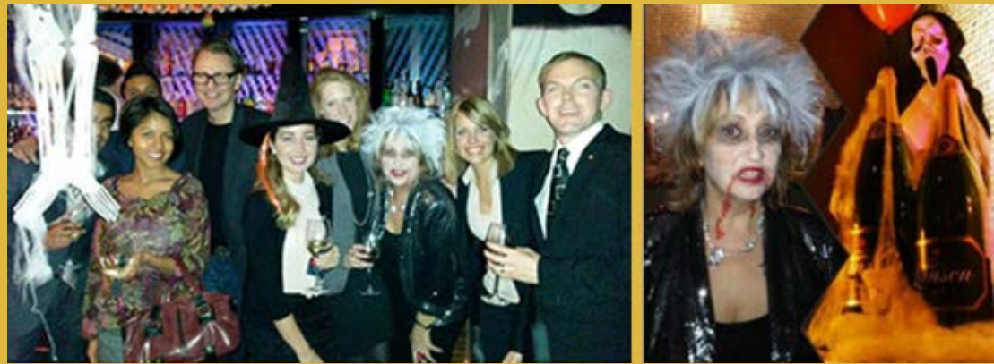
Hotel guests and clients at Millennium Mayfair's Avista Bar.

Millennium Mayfair's Avista Bar hosted a great Halloween Party complete with decorations like spider's webs, skeletons and Halloween Lanterns to create a more festive atmosphere. Fifty local guests & clients danced the night away to tunes including Michael Jackson Thriller. Both clients and guests had a fabulous time as they danced and laughed the night away.