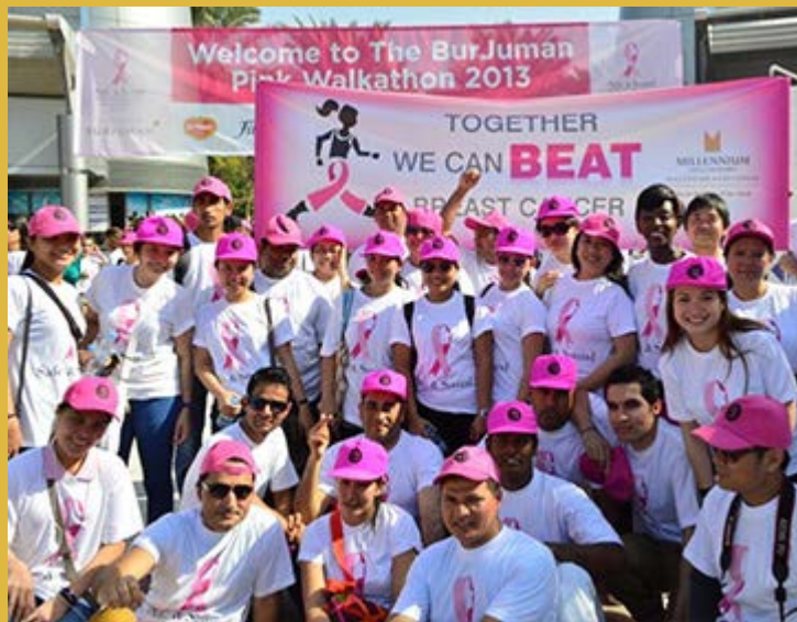
Staff from M&C MEA joined more than 15,000 people in the 2013 Burjuman Pink Walkathon to raise funds for breast cancer.

Millennium & Copthorne Hotels, Middle East & Africa recently took part in the 2013 Burjuman Pink Walkathon, which took place at Zabeel Park, Dubai to raise funds for breast cancer. The non-competitive 3.6 kilometre walk was followed by a Pink Party including live music and arts & craft activities.