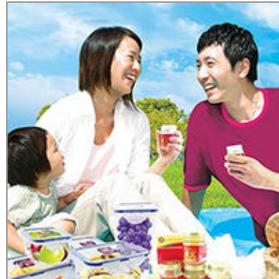
HLF's High Fixed Deposit Rate