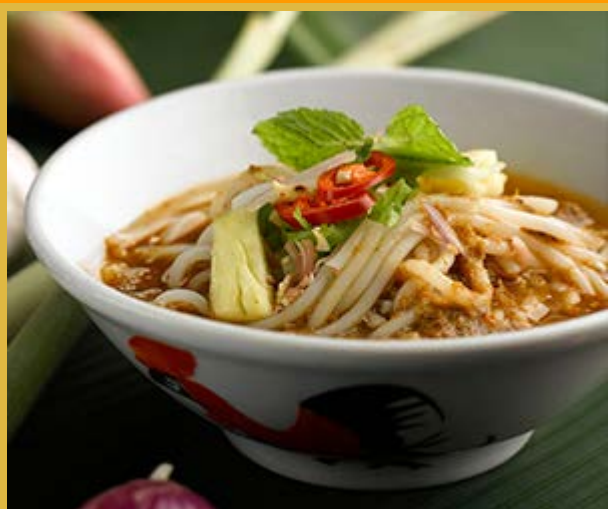
Celebrate a 'Penang Style' Christmas at Princess Terrace, Copthorne Kings Singapore.

Call 6233 1100 or email dining.gcw@millenniumhotels.com