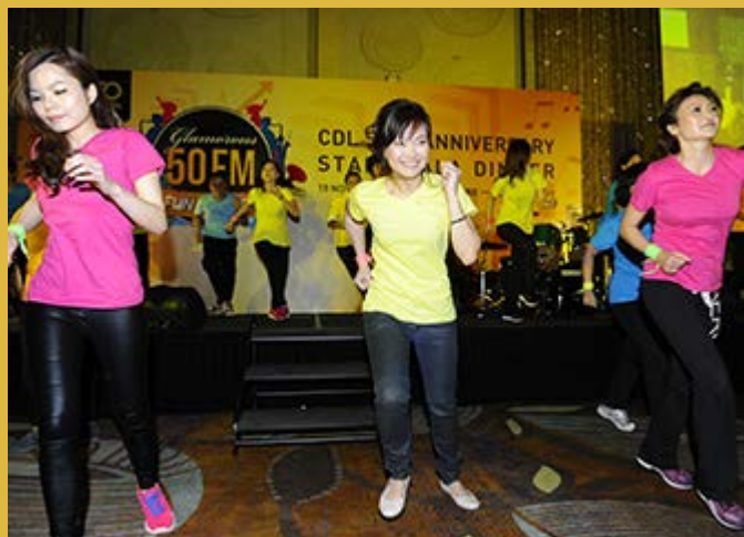
The evening started on a high note with an adrenalin-pumping "Flash Mob" performance by CDL staff.