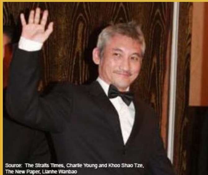
Hong Kong director Tsui Hark of critically-acclaimed films such as Once Upon a Time in China and Seven Swords waving to the media as he attended the wedding reception.