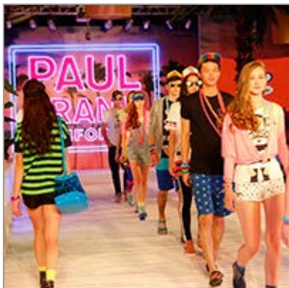
Paul Frank Collection At Millennium Hongqiao