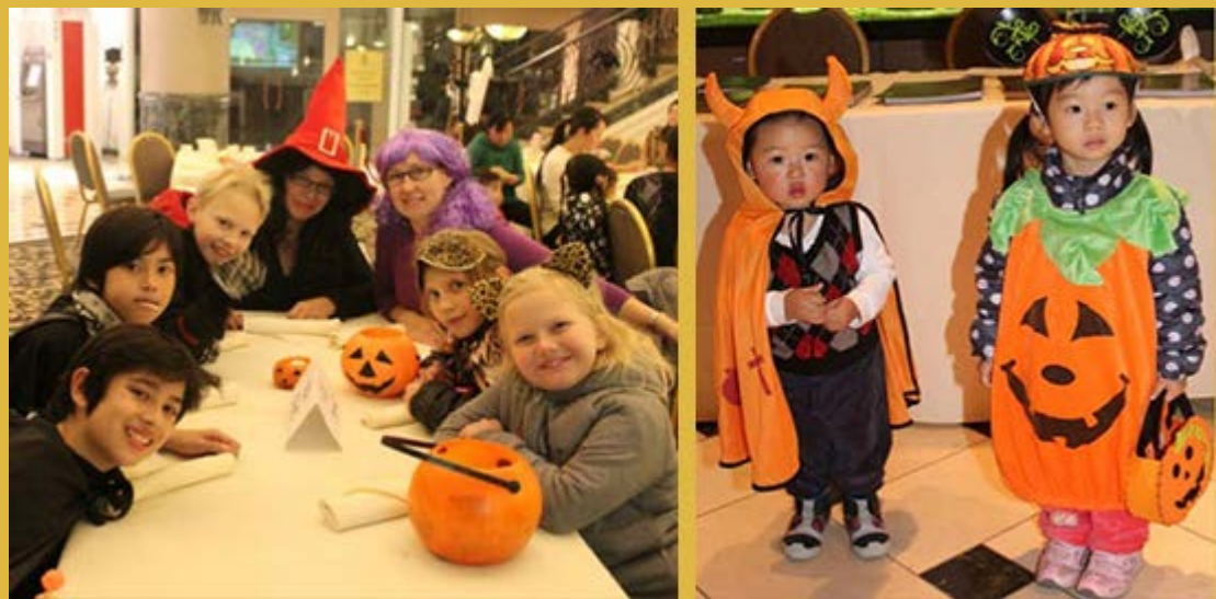
Friends and family having a great time at Beijing Riviera's Halloween party

Over in China, residents at Beijing Riviera Country Club celebrated the occasion with residents distributing candy and other goodies to the younger members of the Riviera community.