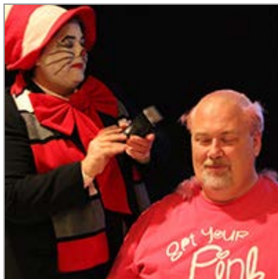
Millennium Cincinnati GM Shaves Bald For Charity