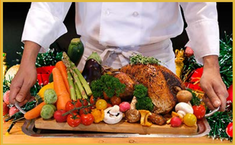
Savour Orchard Hotel's Nonya Roast Turkey with Buah Keluah spices.

Visit the hotel's facebook page for more details: https://www.facebook.com/OrchardHotelSingapore