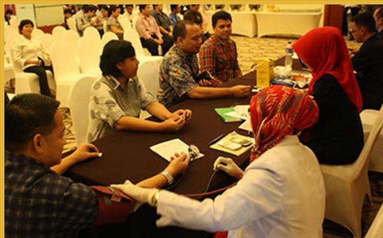
A doctor from the Red Cross checking for a potential donor's blood pressure.

This year saw over 150 participants that include hotel staff and members of the public.