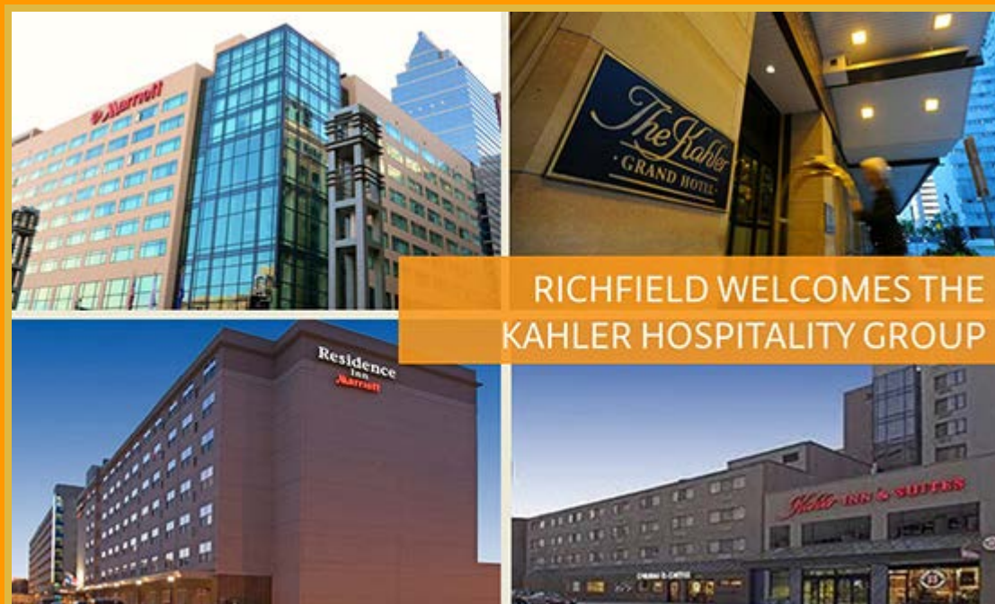
Clockwise from top left: Marriott Rochester Mayo Clinic Area, Kahler Grand Hotel, Kahler Inn & Suites, Residence Inn by Marriott Rochester Mayo Clinic Area.

"To provide the special service that guests require, especially when including health care related issues. This portfolio also can leverage economies of scale to operate at a highly efficient level, while encompassing luxury to extended stay hotel categories."