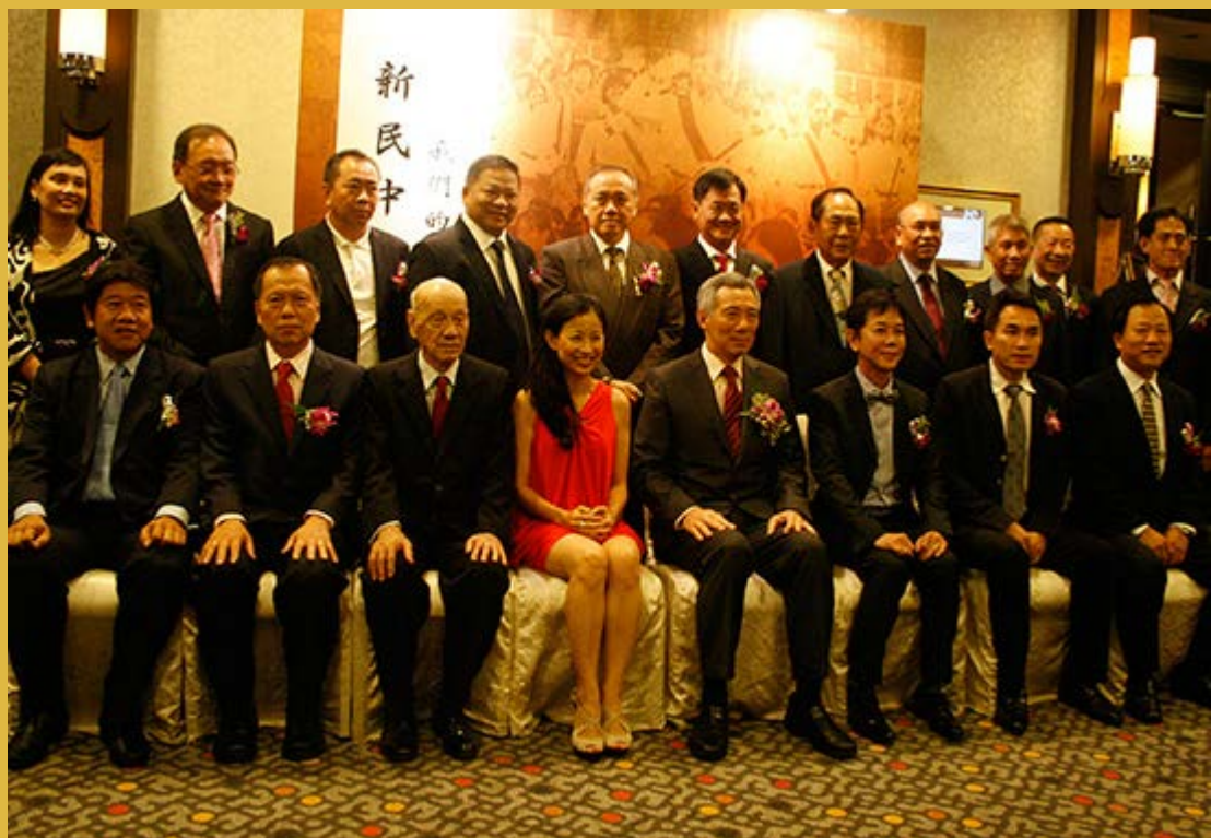
Singapore Prime Minister Lee Hsien Loong (bottom row, fifth from left) was at Orchard Hotel Singapore for the Gala Dinner thrown by Xin Min Secondary School's Alumni Association. The dinner was held to thank donors who had contributed to the school's building fund.