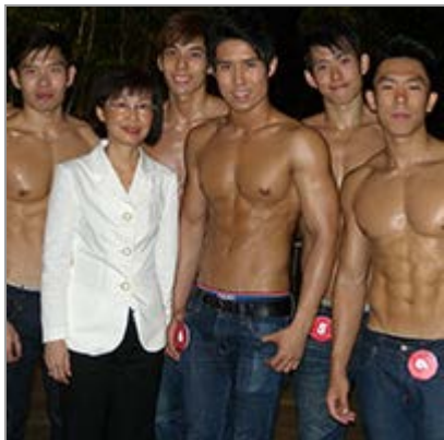
Smokin' Hot At Studio M