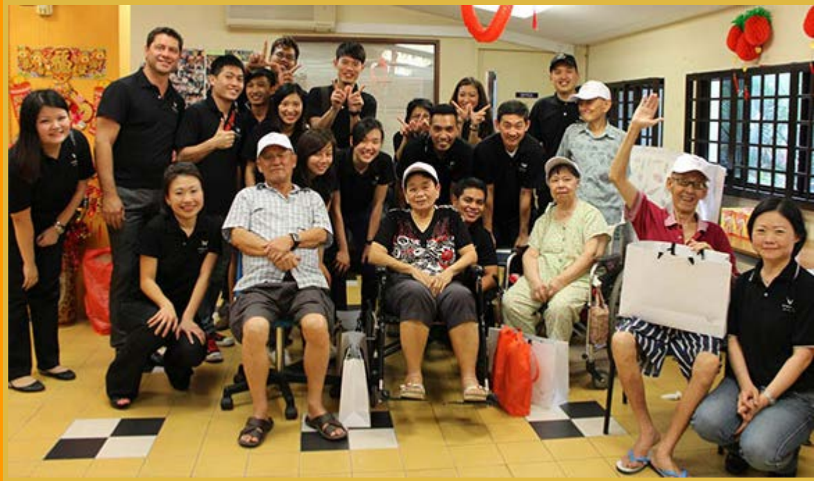
Residents at Thye Hua Kwan Moral Society were very much appreciative of the activities organised by the W Singapore team