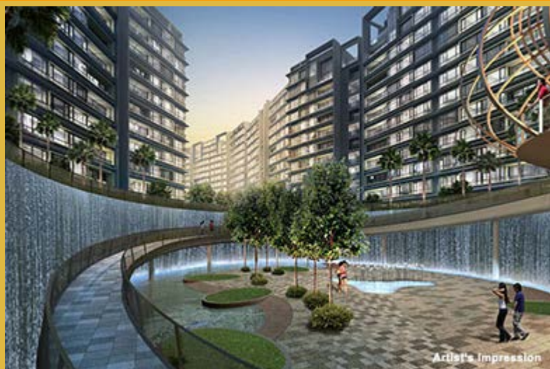
Nestled within the tranquil Pasir Ris Grove residential enclave, D'Nest will be one of CDL's three planned launches for the first half of 2013.

Likewise, the Group's overseas expansion efforts in 2012 have been fruitful. CDL China Limited, the Group's wholly-owned subsidiary, has received planning approval for its Eling Hill luxury residential development in Chongqing and its mixed-use development next to Jinji Lake in Suzhou. Construction is expected to begin in mid-2013 for these two sites. The launch of these projects will be timed appropriately when the China property market improves. The Group also acquired indirect interests in Thailand properties, namely Jungceylon Shopping Mall – the largest shopping complex on Phuket Island, Millennium Resort Patong Phuket Hotel and a retail development known as Mille Malle.