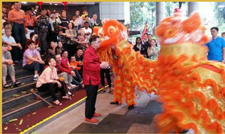
Ushering in the Year of the Snake with a Lion Dance performance on Chinese New Year at the Orchard Hotel Singapore driveway, which attracted guests and visitors