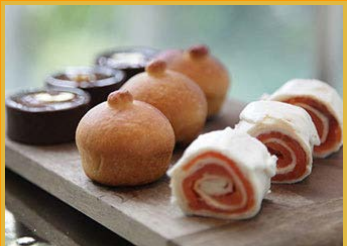
Chill out, relax and enjoy an exquisite high-tea session, complete with a seaview