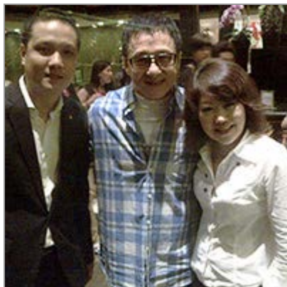
Superstar Jackie Chan At Orchard Hotel