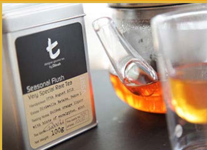
The award-winning Dilmah Seasonal Flush is available exclusively at WOOBAR

Call 6808 7258 or email woobar.singapore@whotels.com for reservations. DROP THE T 2 happens daily from 3-5pm at WOOBAR.