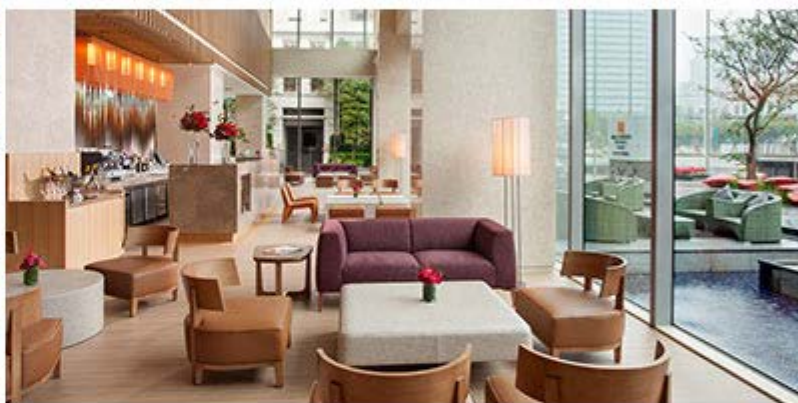
The hotel offers stunning views of the Taichung's unique blend of urban and natural scenery.