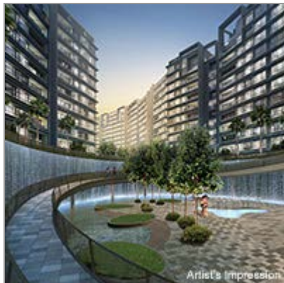
Record Revenue in 2012 For CDL