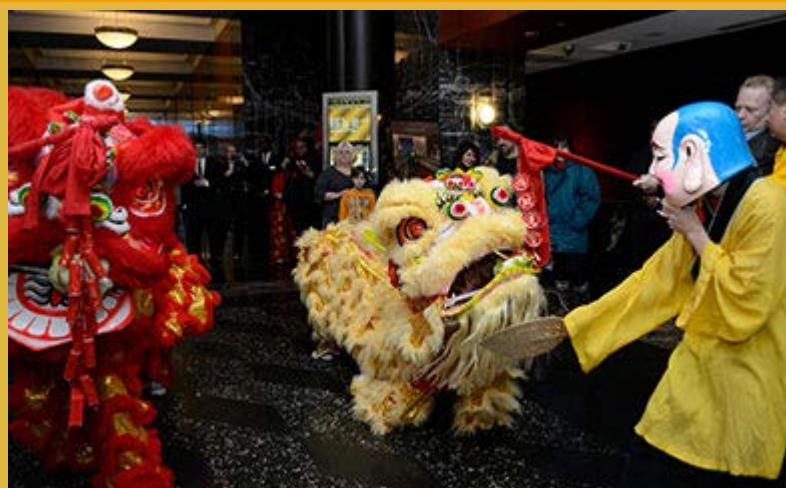
Hotel guests and visitors were entertained by the lion dance troupe

The Millennium Broadway Hotel New York hosted four local New York City families on February 9 th who were recently affected by Superstorm Sandy. These special guests were treated to a colourful and exciting Lion Dance performance by the Chinese Community Center of New Jersey Youth Group. Red packets filled with chocolate coins were also distributed to all hotel guests as a token of good luck and prosperity.