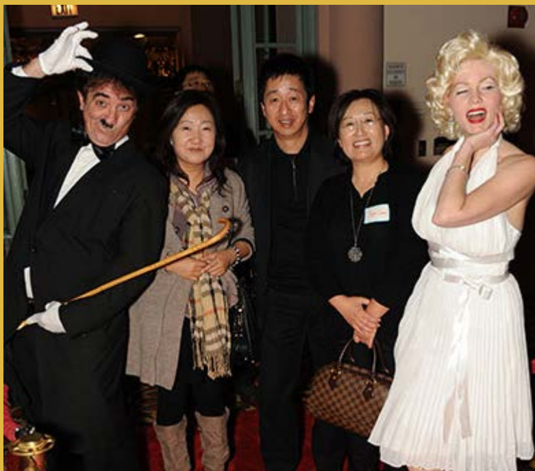
"Celebrities" galore at the Biltmore

As the guests soaked in the fun and activities, the hotel's executive and sales teams took the opportunity to catch up with their corporate and other loyal customers on a more personal basis and extend their deep appreciation for their business.