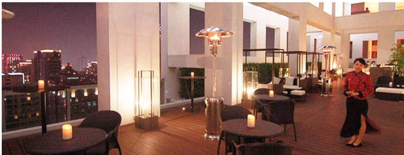
Millennium Vee is the first hotel in Central Taiwan (or Taichung) with a roof top sky bar complete with state-of-the-art entertainment features.