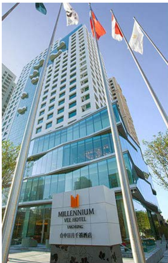
Millennium Vee Taichung is the first 5-star hotel in Central Taiwan.

In each issue, we cast the spotlight on one of the business sectors that make up the global world of the Hong Leong Group