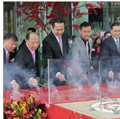
Millennium Vee opens in Taichung, Taiwan