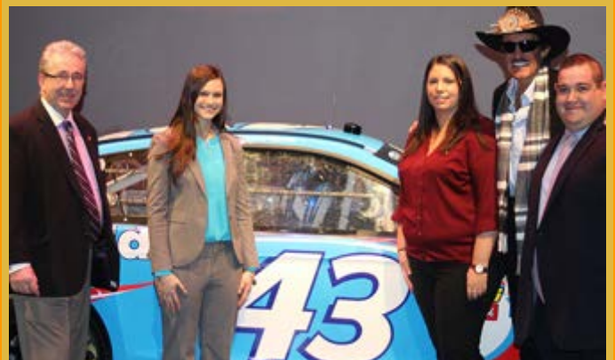
(Second from right in cowboy hat) Race car driver Richard Petty was at Millennium Broadway for an event hosted by Smithfield Foods. Known to many simply as "The King," Richard Petty is the most decorated driver in the history of NASCAR racing, winning a record 200 races and seven NASCAR Sprint Cup Series championships during his illustrious career.