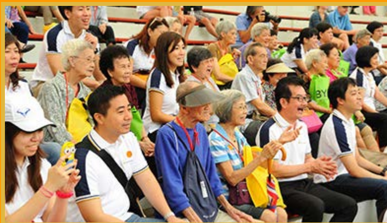
The seniors were entertained with a tram ride through the Zoo, toured the Fragile Forest Exhibit, and watched sea lion performances which drew peals of laughter from the group.