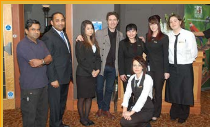
(Fourth from left) Actor Paul McGann who played The eighth Dr Who, the title character of a popular sci-fiction tv series, was at Copthorne Hotel Slough – Windsor's Dr Who convention. The actor spent a busy night signing autographs, being interviewed on stage and having his photo taken with fans.