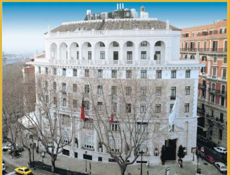
Situated on Via Veneto, the 87-room Boscolo Palace Roma is M&C's first hotel in Italy.

This acquisition follows the purchase of Novotel New York Times Square in February 2014 and a London hotel in the Chelsea Harbour district in December 2013. Located in the heart of the Manhattan theatre district, the Novotel New York Times Square (US$273.6 million) contains the 480-room hotel, a