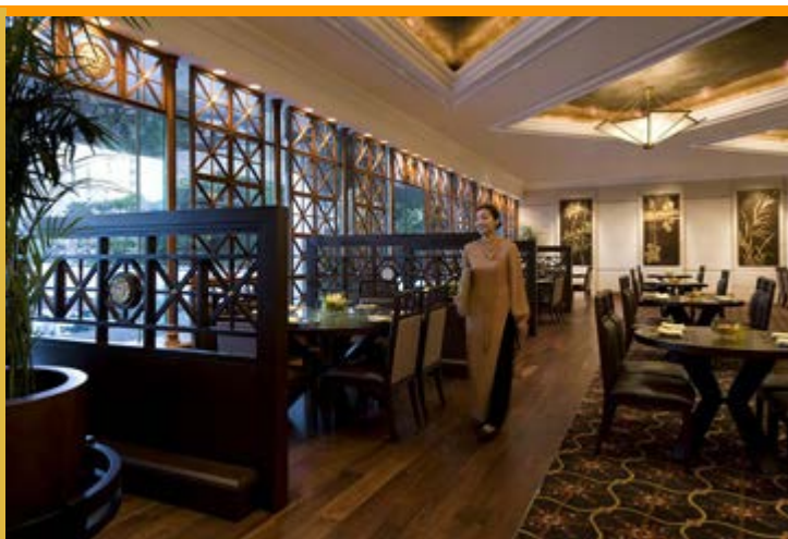
Man Ho Chinese Restaurant

31 March, diners can look forward to an exquisite presentation of recipes from this famous region for lunch and dinner at Man Ho Chinese Restaurant. Culinary highlights include Deep-fried Minced Fish Ball with Clam Sauce, Sautéed Crab Meat and Olive Nuts with Fresh Milk as well as Pan-fried Whole Carp with Minced Fish, Mushroom, Preserved Meat and Dried Shrimp.