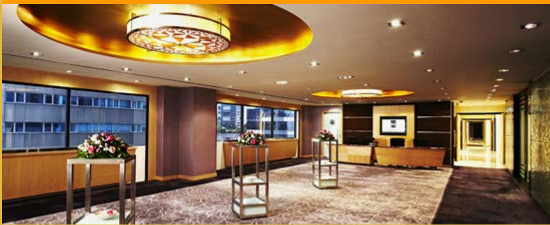
M Hotel is a popular venue for weddings.