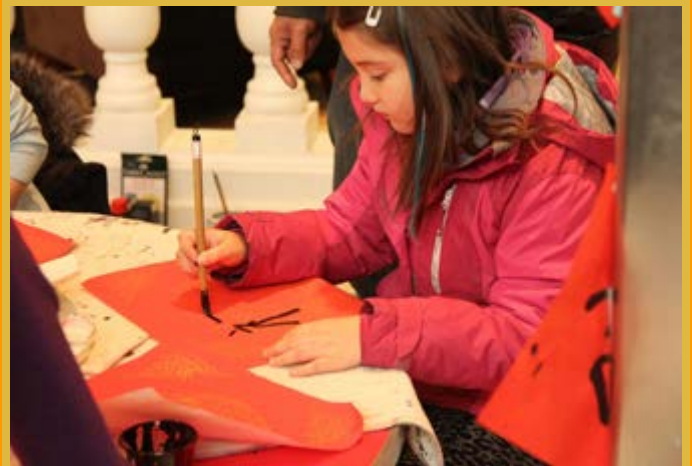
The annual Chinese New Year Temple Fair was hosted by both Beijing Riviera and Dulwich College and attracted crowds of parents, students and residents to take part in an assortment of activities. The Feb 2 event had stalls, dancing dragons and face-changing performances.