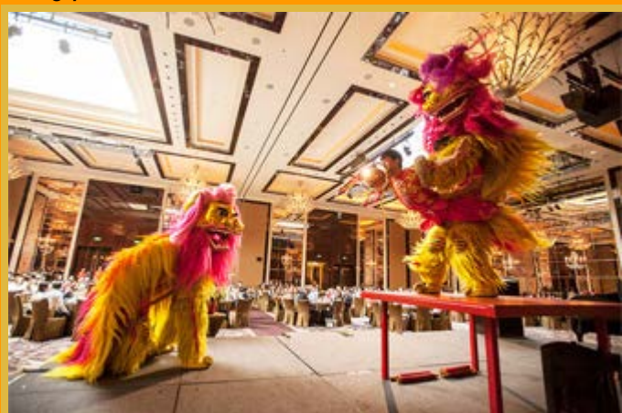
Guests enjoying the breathtaking lion dance performance at a Chinese New Year lunch at The St. Regis Singapore.