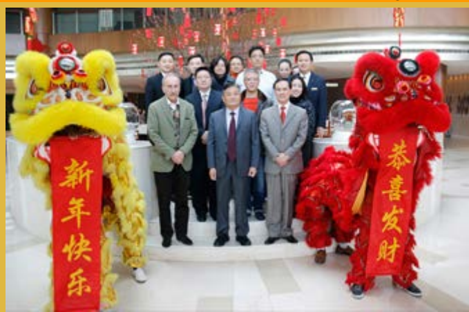
Auspiciously-coloured gold and red lions welcome a year of prosperity and good luck at the Millennium Hongqiao Hotel Shanghai.