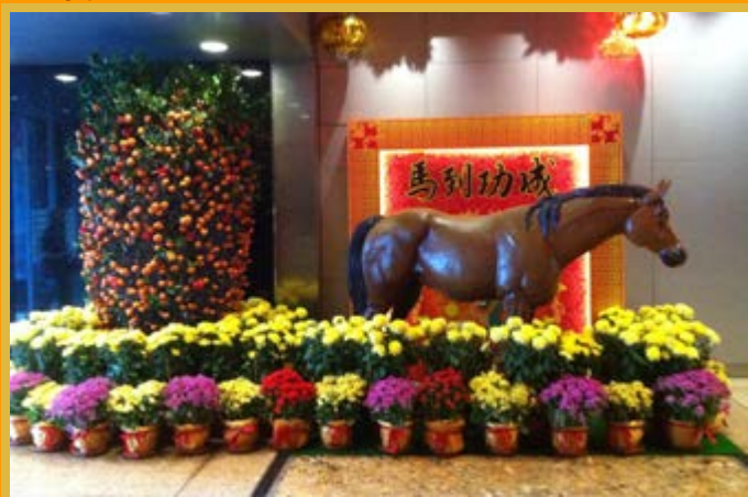
Chinese New Year decorations add a festive touch to Hong Leong Building.