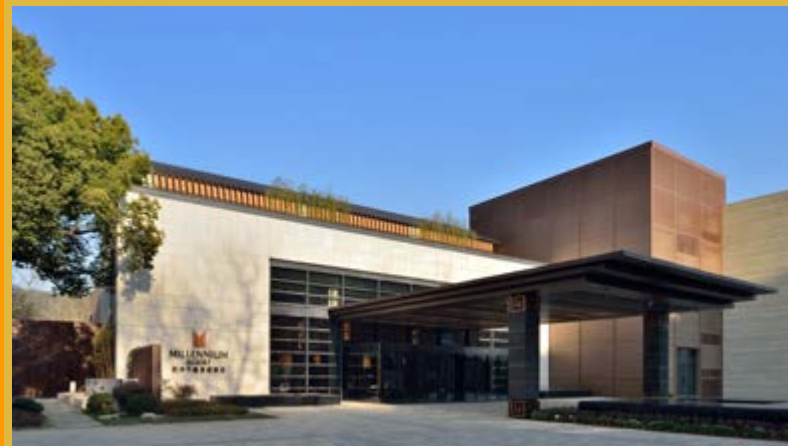
Millennium Resort Hangzhou will be M&C's first resort in China.

More than just a great location, Millennium Resort Hangzhou will bring impeccable and highly personalised service to all guests, continuing the tradition of being warm and genuine hosts that is the