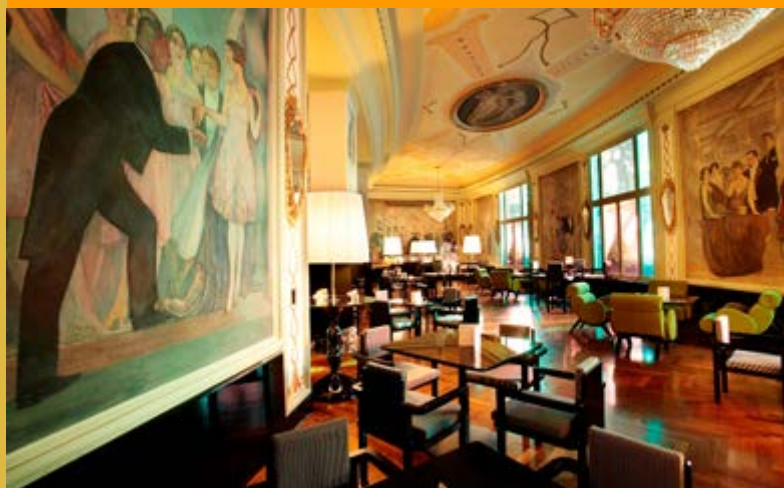
The Restaurant & Lounge Bar Cadorin is adorned with frescoes by Guido Cadorin with images of the upper classes of Rome in the 1930s.

penthouse apartment, and limited office and rental space. Built in 1981, the four-star hotel underwent extensive renovations to all guest rooms, public spaces and service areas that were completed in 2013. It will continue to operate under the Novotel brand by Accor Group.