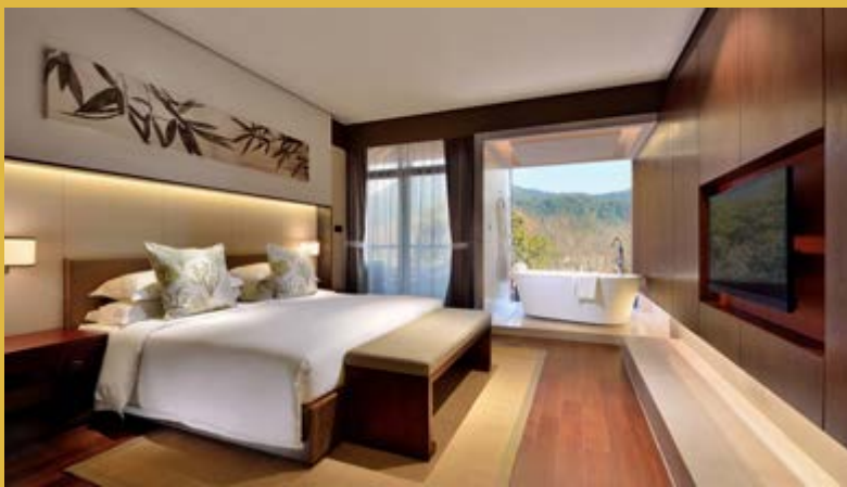
The elegantly-designed guest rooms and suites are equipped with high-speed wire and wireless internet access, LCD TV and connections for various portable electronic devices.

very essence of this Asian hospitality brand.