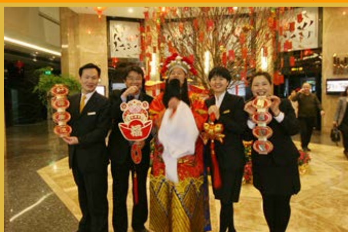
Staff at Millennium Hotel Harbourview Xiamen pose with Cai Shen Ye, the God of Fortune, as the hotel ushers in the year of the horse.