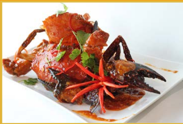
Singapore Chilli Crab Served with Deep-fried Mantou

Indulge in shellfish prepared in a variety of delectable ways. Be enthralled by Lobster Bisque with Herb Crouton, Singapore Chilli Crab served with Deep-fried Mantou, Sauté Bamboo Clam with Szechuan Dried Chilli and Kung Po Sauce and more.