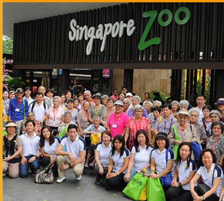
Tired yet happy faces were all around as the event ended on a good note.