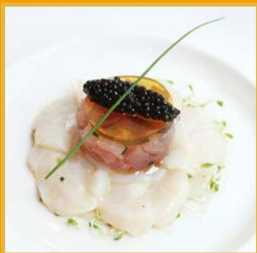
Premium Italian Organic "Caviar" served with Wood-Smoked Norwegian Salmon

Chef Daniele Sarno aims to woo your palate with new additions to the à la carte menu such as Porcini Mushroom Stuffed Panzerotti, premium Italian Cheese Fondue, fresh Black Truffle and Vialone Nano Rice, Italian Saffron Infusion, "Stracchino" Cheese and Chives and more.