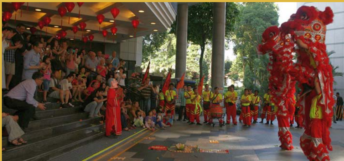
Orchard Hotel Singapore hosted an acrobatic Lion Dance performance to mark the first day of the Lunar New Year.