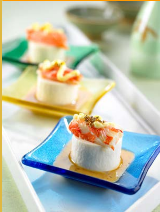
Chilled Bean Curd and Snow Crabmeat from Hotel Nikko Hongkong's Lobby Lounge

Alternatively, you can drop by the restaurant on the mezzanine floor of Hotel Nikko Hongkong, 72 Mody Road, Tsimshatsui East, Kowloon.