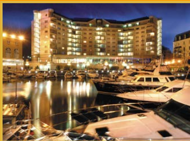
The luxury Wyndham Grand London Chelsea harbour is located on the River Thames and is part of the Chelsea Harbour development.