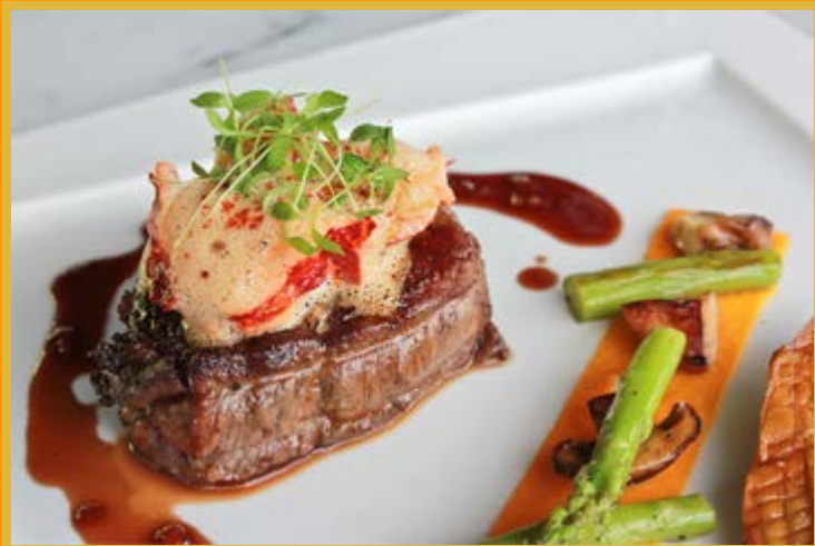
Savoury Wagyu Beef from Starscafé

Beef lovers are in for a gastronomic treat. Entice your palate with our flavourful Wagyu beef grilled to perfection.