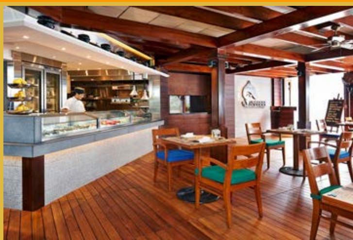
Fish Bar at JW Marriott Hotel

Seafood lovers can look forward to enjoying Fish Bar's carabineros prawns promotion that will be available for lunch and dinner, from 7 to 30 March. Renowned for its vibrant red colour, robust and lobster-like sweetness flavour as well as coveted for its large size, these quality crustaceans will be prepared with extra virgin olive oil, garlic, parsley and brandy. Simply delicious!