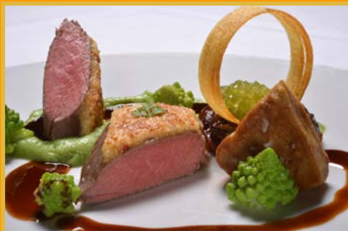
Enjoy a variety of delectable dishes whipped up by Michelin-starred chef, Marcello Fabbri at LaBrezza.

Over the decadent 6-course set dinner priced at $188++ per person with wine pairing, diners can expect to enjoy his culinary mastery and creative flair of quintessential Italian dishes, like the succulent Poached Canadian Lobster with Italian potato salad and sun dried tomato, creamy Velouté of Cauliflower, with Sturia Caviar and Quail Eggs and Handmade Garganelli, with raw marinated shrimps, shaved black truffles and saffron. Guests can also indulge in Sous Vide Fillet of Sole, with carrot and purple potato mash, tarragon and tomato-vanilla emulsion and the luscious Gratinated Grain-Fed Rack of Lamb, served with Mediterranean vegetable with thyme and natural jus. The meal will end on a satisfying sweet note with Orange Ravioli served with Amaretto ice cream.