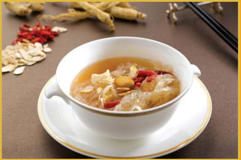
Double-Boiled Bird's Nest Consommé with Yunnan Ham and Ginseng at Yan Ting

This March and April, indulge in exciting and exclusive highlights at The St. Regis Singapore – luxuriate in an indulgent package for a perfect holiday retreat or choose to delight in epicurean refinement. LaBrezza presents a specially-crafted menu featuring heavenly homemade dishes of Lombardia cuisine, Yan Ting offers a decadent epicurean fare of ginseng indulgences while Brasserie Les Saveurs, delight in exquisite à la carte creations using the delectable morel mushrooms.