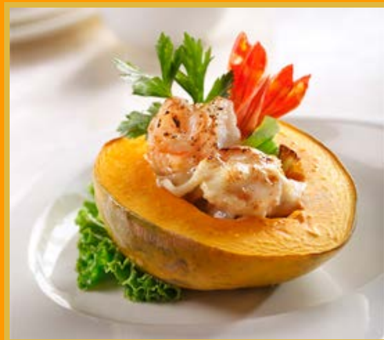
Baked Scallop and King Prawn with Cheese served in Hawaiian Papaya

For reservations, call 6318 3193/198 or email tiencourt@millenniumhotels.com