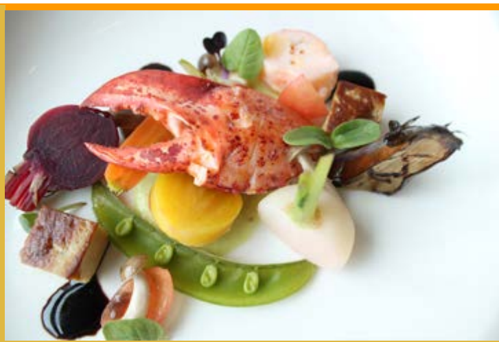
Blue Lobster at Pontini