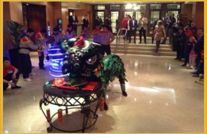
Millennium Gloucester Hotel London Kensington got into the spirit of the Lunar New Year with a visit and a performance by a Lion Dance Troupe.