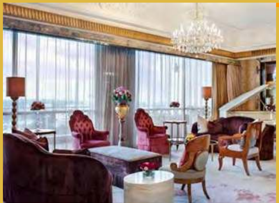
The Presidential Suite living room with Jim Thompson throw pillows and leather-bound writing desks, is just one extension of The St. Regis Singapore's bespoke luxury.

The T+L awards are annual surveys where Travel + Leisure readers determine the top hotels and resorts in the world. These are based on rooms, facilities, location, service, food and restaurants, as well as service.