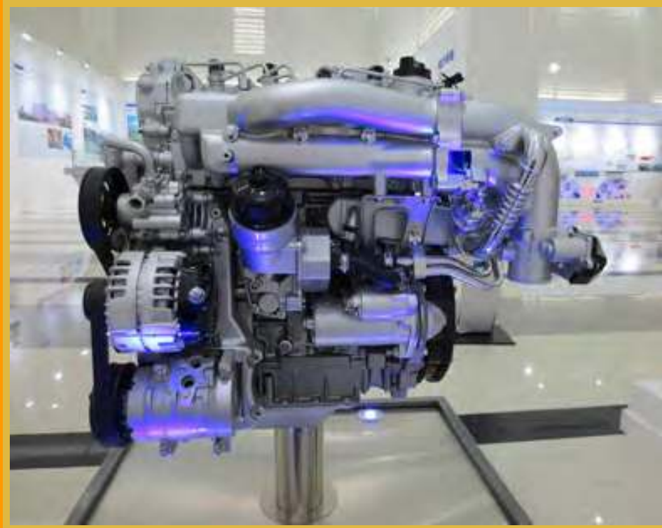
China Yuchai's engines were used in various applications for the infrastructure of 2014 Sochi Winter Olympics Games.

Engines from the China Yuchai International's (CYI) main operating subsidiary, Guangxi Yuchai Machinery Company Limited (GYMCL), were used in various applications to build the infrastructure for the recent 2014 Sochi Winter Olympic Games.