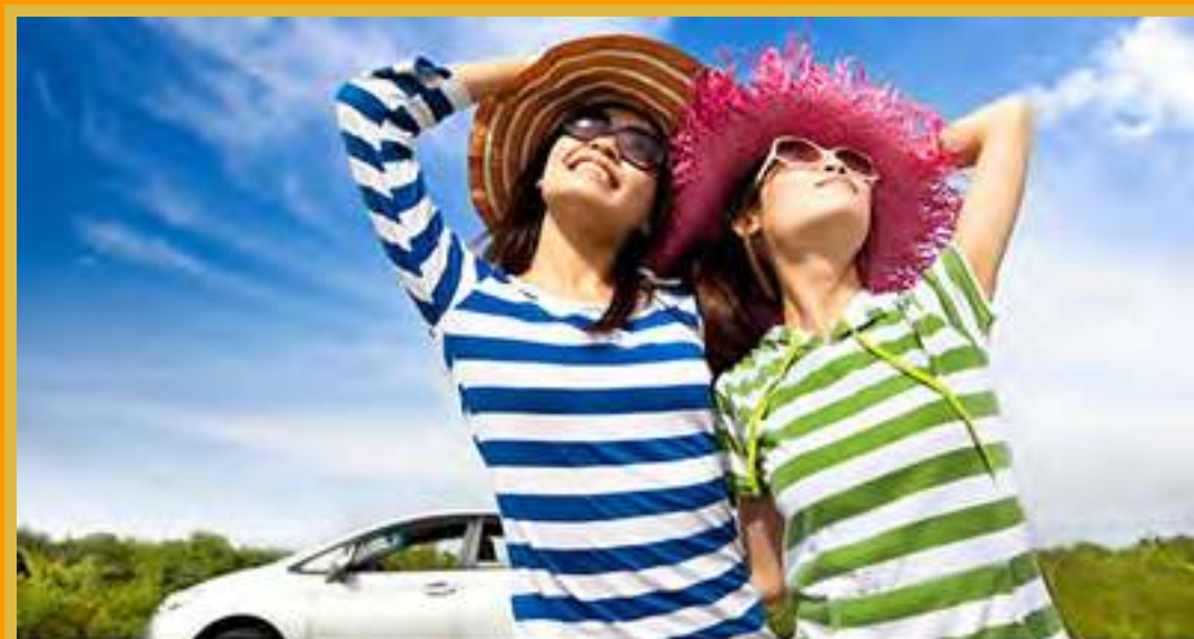
Double up the fun with double points when you stay at our New Zealand hotels.

List of participating hotels: Millennium Hotel Rotorua, Millennium Hotel Queenstown, Copthorne Hotel & Resort Bay of Islands, Copthorne Hotel Auckland City, Copthorne Hotel Auckland HarbourCity, Copthorne Hotel Rotorua, Copthorne Hotel Wellington Oriental Bay, Copthorne Hotel & Apartments Queenstown Lakeview, Copthorne Hotel & Resort Queenstown Lakefront