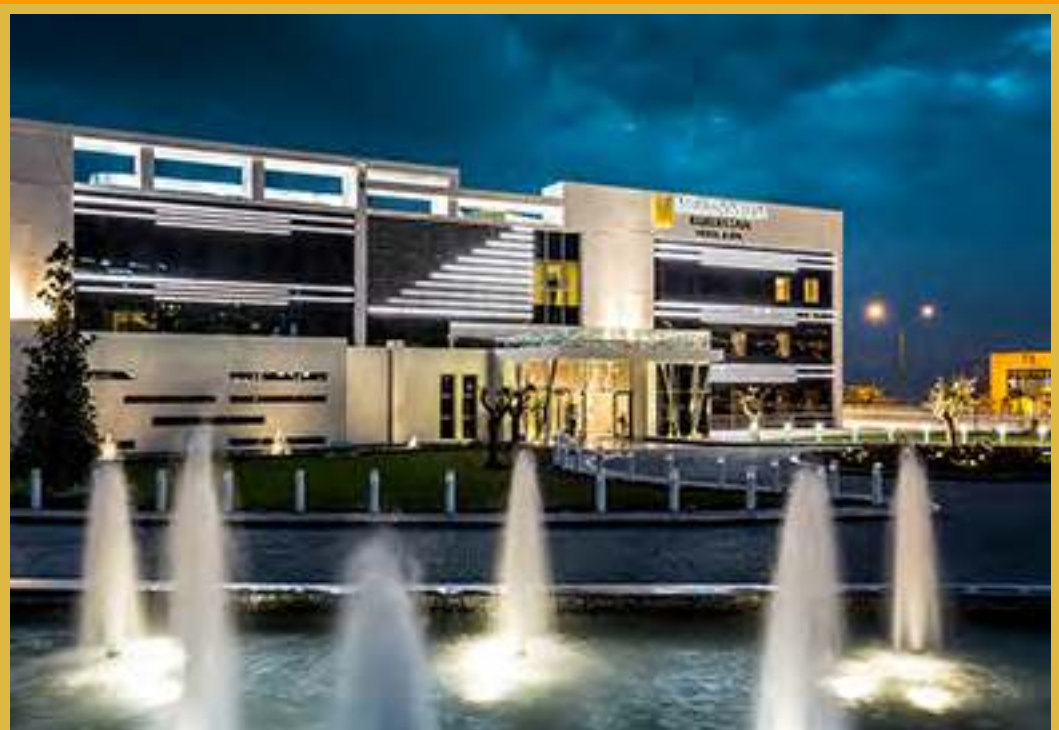
The 135-room Millennium Kurdistan Hotel & Spa caters to both business and leisure travellers.

The 135-room hotel is aimed at both business and leisure travellers with all the rooms equipped with modern facilities and high-speed wi-fi available throughout the property.