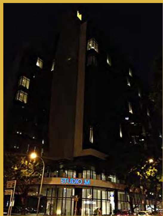
Turning off the façade lights at Studio M hotel is one example of M&C's energy-saving measures.

In line with Earth Hour, Hong Leong Group embarked on a month-long initiative to further reduce its carbon footprint.