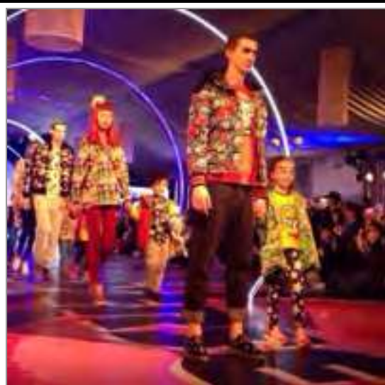
Paul Frank's New Collection At Millennium Hongqiao Shanghai