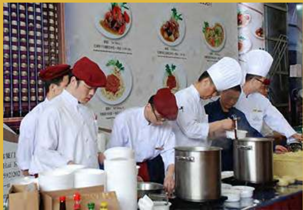
Food and beverages are provided at the millennium delicatessen counters for exhibitors and visitors.

As part of a long-term official partnership with Xiamen International Stone Fair, the Millennium Harbourview Hotel Xiamen has once again been chosen as the designated five-star hotel to provide catering service for the 2014 Xiamen International Stone Fair. Its rich experience of fair cooperation, ability to provide high-quality food & beverage as well as top-notch service are reasons for its appointment. The Xiamen International Stone Fair 2014 will be the world's largest stone exhibition, spreading across 160,000 with 8250 exhibition booths. Millennium delicatessen counters will be set up at the junctions of hall A and hall T to provide on-spot dining services and beverages for exhibitors and visitors.