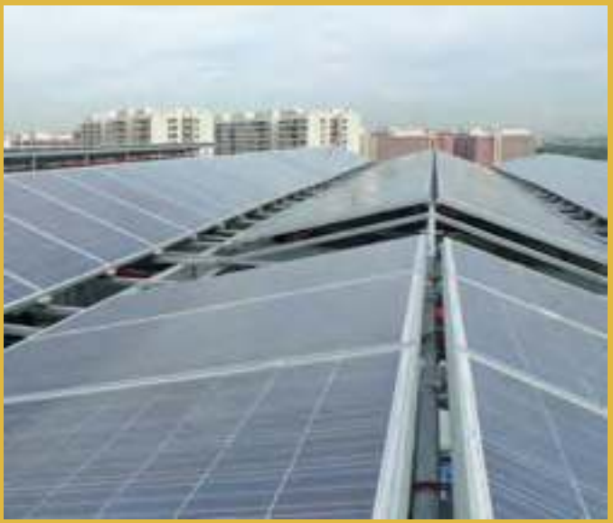
CDL's 7 & 9 Tampines Grande is a green office that embraces one of the largest and most extensive use of solar technology in a commercial property in Singapore, generating 203,000 kWh of clean energy.

At the group's commercial buildings, existing measures to save water are already in place, including the wide use of water efficient fittings, use of alternative water sources and use of drought-tolerant plants for green roofs, to reduce the need for frequent irrigation.