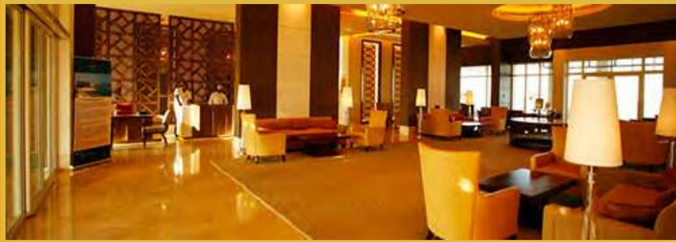
Millennium Resort Mussanah.

To make a reservation, please call +968 268 71555 or email: reservations@mill-mussanah.com .