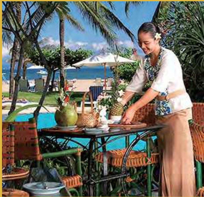
Grand Millennium Beijing's very first Indonesian Food Festival at CBD International Cuisine.

CBD International Cuisine invites you to the first Indonesian Food Festival held from 21st to 31st March 2014!