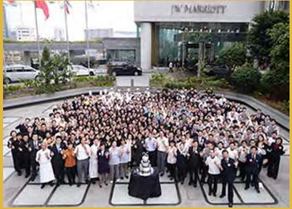
Staff at JW Marriott Hotel Hong Kong celebrating the hotel's 25th anniversary.

Several activities were also held to thank all of the hotel’s 750 associates for their efforts and dedication, including its 32 charter members who have been with the hotel since its opening for their efforts and dedication. These events included a Silver Jubilee annual staff party as well as an afternoon tea gathering at the staff cafeteria, followed by a group photo to serve as a special memento of the hotels’ 25th anniversary.