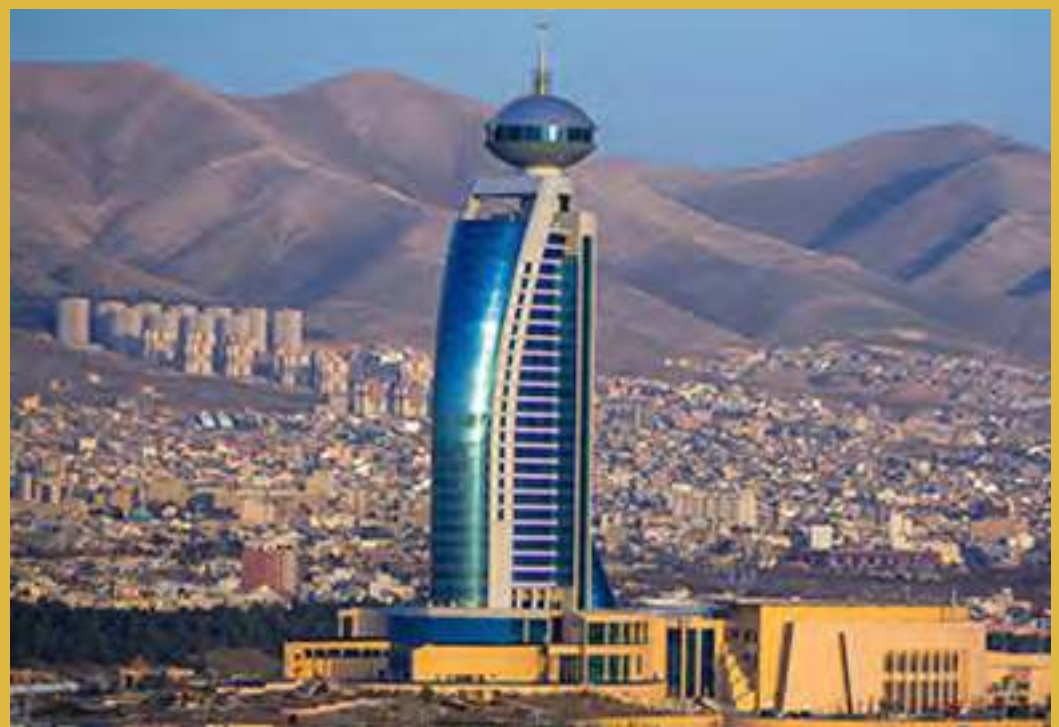
The 5-star Grand Millennium Sulaimani is the tallest structure in Sulaymaniyah

M&C also recently opened the Millennium Kurdistan Hotel and Spa which is located in the rapidly developing outskirts of Sulaymaniyah, close to the Faruk Medical City, one of the leading medical institutes in the country. The 135-room hotel is aimed at both business and leisure travellers with all the rooms equipped with modern facilities and high-speed wi-fi available throughout the property.