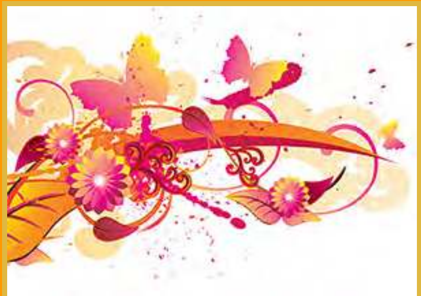
Enjoy spring with fabulous offers at our Millennium Hotels!

Participating Hotels: Millennium Alaskan Hotel Anchorage, Millennium Bostonian Hotel Boston, Millennium Harvest House Boulder, Millennium Hotel Buffalo, Millennium Knickerbocker Hotel Chicago, Millennium Hotel Cincinnati, Millennium Hotel Durham, Millennium Biltmore Hotel Los Angeles, Millennium Hotel Minneapolis, Millennium Maxwell House Nashville, Millennium Broadway Hotel New York, Millennium Resort and Villas Scottsdale, ONE UN New York