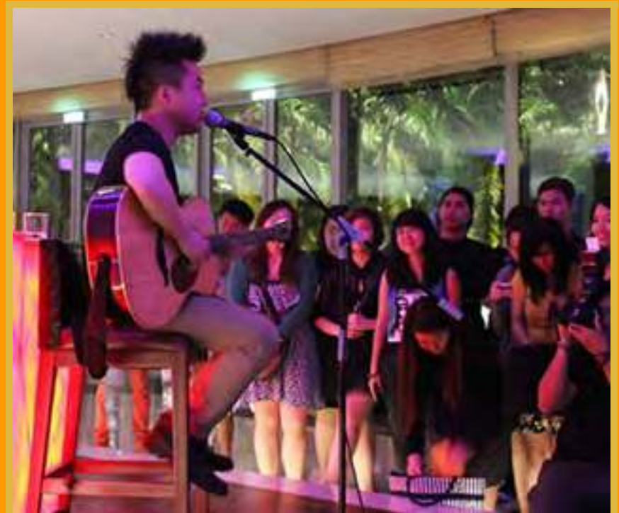
YouTube Sensation David Choi serenading his fans in an up close and personal session at WOOBAR.

With three albums to his name, David Choi was named YouTube's 15th-most-subscribed musician and 62nd-most-subscribed user overall in November 2011.