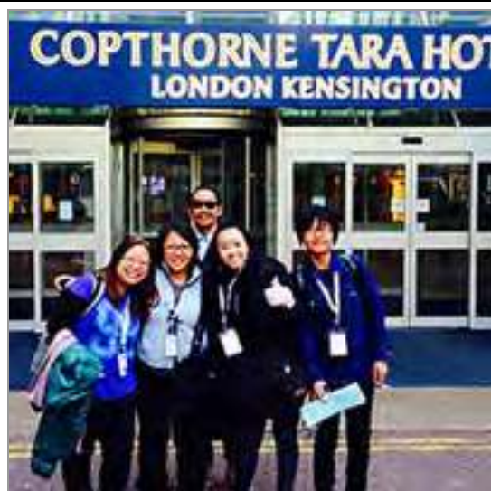
M&C Supports Singapore Day