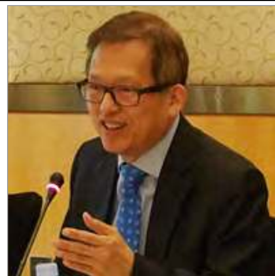
CDL Closes Strong Earnings of S$683 million for 2013