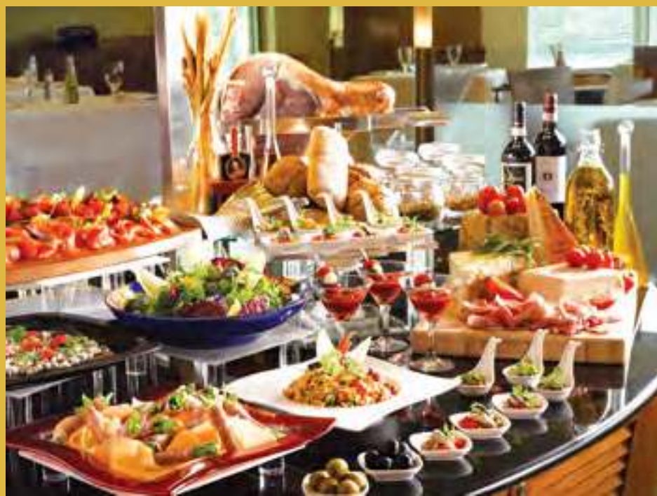
Free flow of antipasti and desserts with every Italian Set Lunch.

Indulge in a delightful Italian set lunch, watch a fashion show and learn grooming tips from an AICI Certified Image Consultant. Enjoy special rates for established local brands such as M Culture, Blake & Co and Cassey Gan and hair and beauty products from Kérastase and Lancôme. You'll get to bring home an exclusive goodie bag and stand to win lots of attractive prizes during our Lucky Draw.