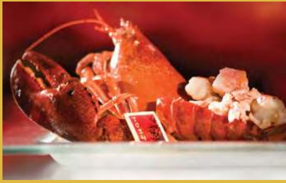
Mouth-watering lobster exclusively at Toshi Asian Restaurant.

Enjoy Seafood delights at Toshi every Sunday! Toshi features a classic array of sensational delicacies which include succulent lobsters, fresh oysters and other seafood dishes for AED 195++ inclusive of wine and selected beer. For reservations, please call +971 2 495 3921 or email toshi@grandmill-alwahda.com .