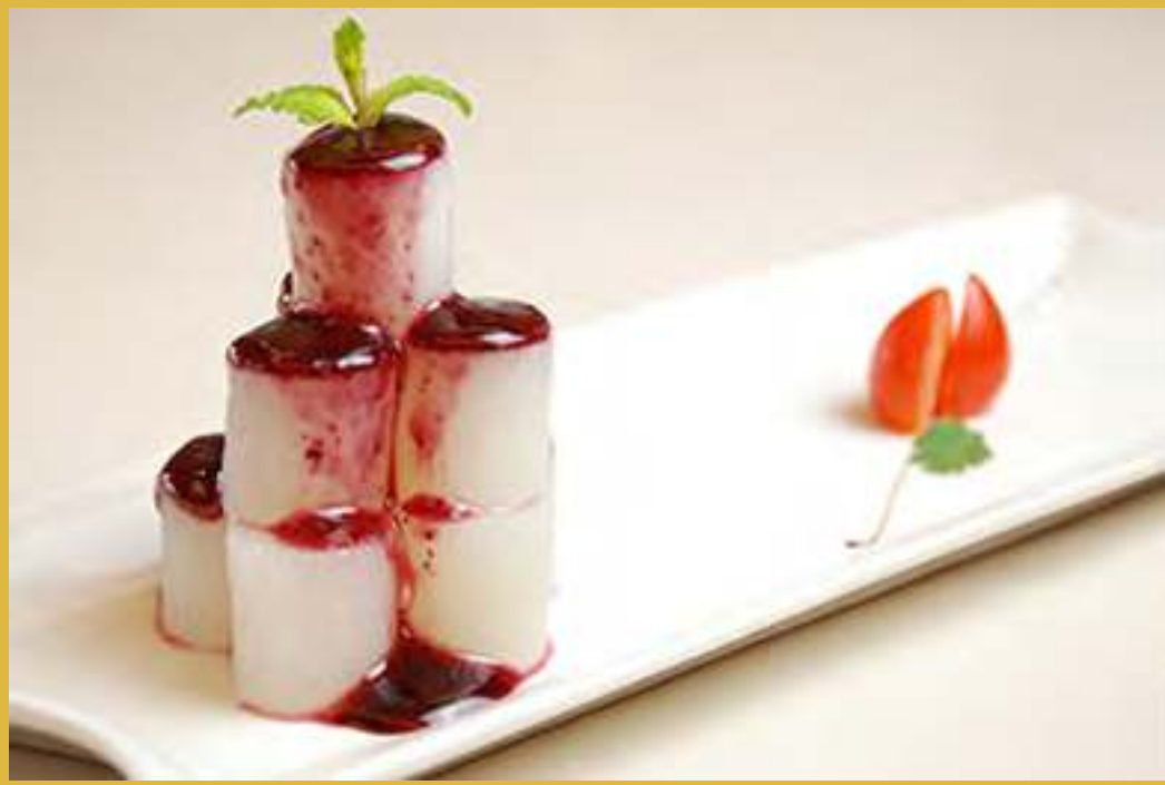
Fried Yam with Blueberry Sauce at Loong Yuen Chinese Restaurant.

Adopting a vegetarian diet is becoming increasingly fashionable due to the many benefits of vegetarian food. Keeping up with trends as well as setting the mood for the upcoming Qingming Festival, Loong Yuen Chinese Restaurant is offering a range of healthy vegetarian dishes which include Braised Vegetables Roll with Bean Curd Sheet, Fried Vegetables-Style Shrimp with Cashew and Celery and Fried Yam with Blueberry Sauce. Be sure to satisfy your taste buds with these dishes cooked to perfection using unique Hong Kong cooking methods as well as carefully selected natural ingredients and olive oil.