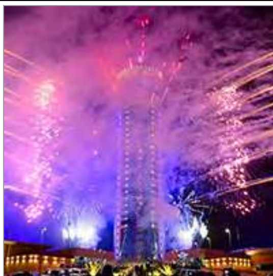
M&C Unveils Grand Millennium Sulaimani in Iraq