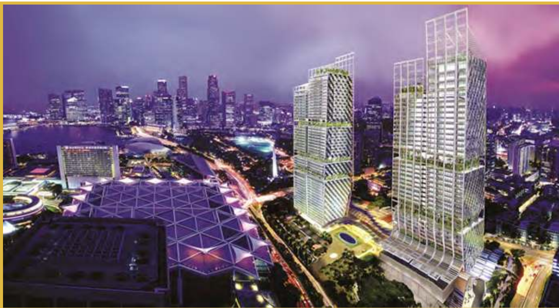
The iconic South Beach development is an integrated development with state-of-the-art commercial, hotel, and residential spaces.

In each issue, we cast the spotlight on one of the business sectors that make up the global world of the Hong Leong Group