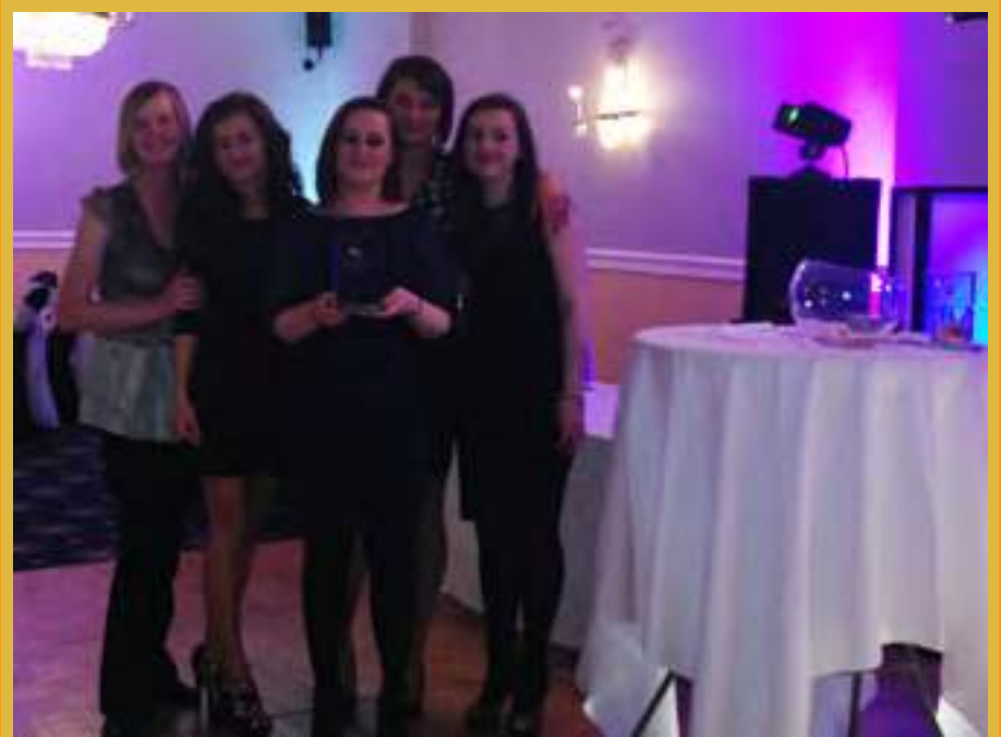
Copthorne Hotel Aberdeen hosted its first Staff Oscars event with great success.

The evening was a great success, enjoyed by all with everyone already looking forward to the 2015 Staff Oscars.