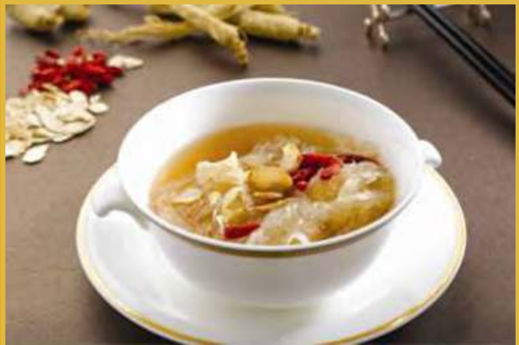
Indulge in a selection of nutritious broths slowly and carefully brewed by the masterchefs of St. Regis Singapore.

For information and reservations, please call (65) 6506 6887 or email yanting@stregis.com or visit www.yantingrestaurant.com .