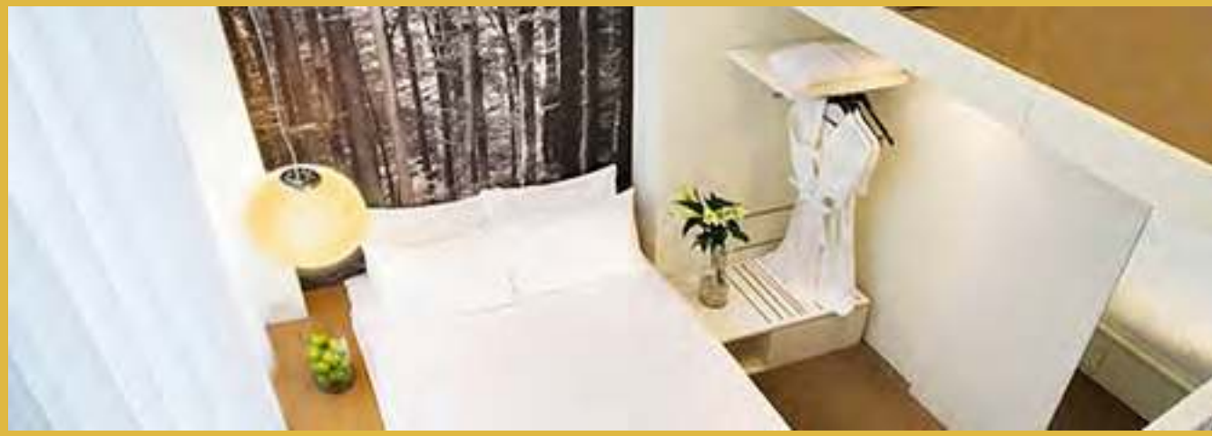
Executive lofts at Studio M Hotel Singapore.

Valid for single or double occupancy, for check-ins from 25 March to 31 December 2014.