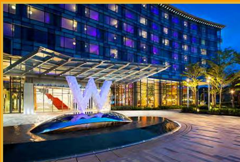
W Singapore – Sentosa Cove's iconic design, infused with the W brand's passion for what's new and next, has made it an ultimate lifestyle destination.

It also serves as a design standard that allows organisations to differentiate themselves as a design and innovation leader, based on design excellence.