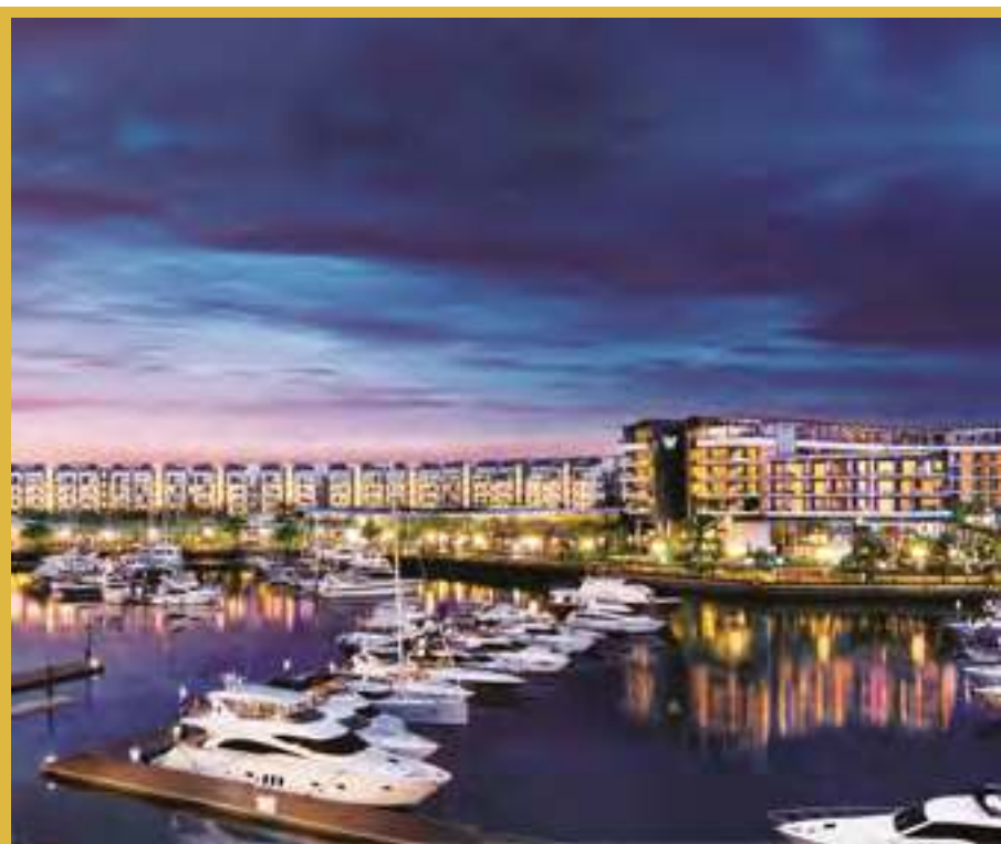
Quayside Isle is part of the integrated luxury waterfront precinct at Sentosa Cove, which includes The Residences at W Singapore – Sentosa Cove, and W Singapore – Sentosa Cove Hotel.