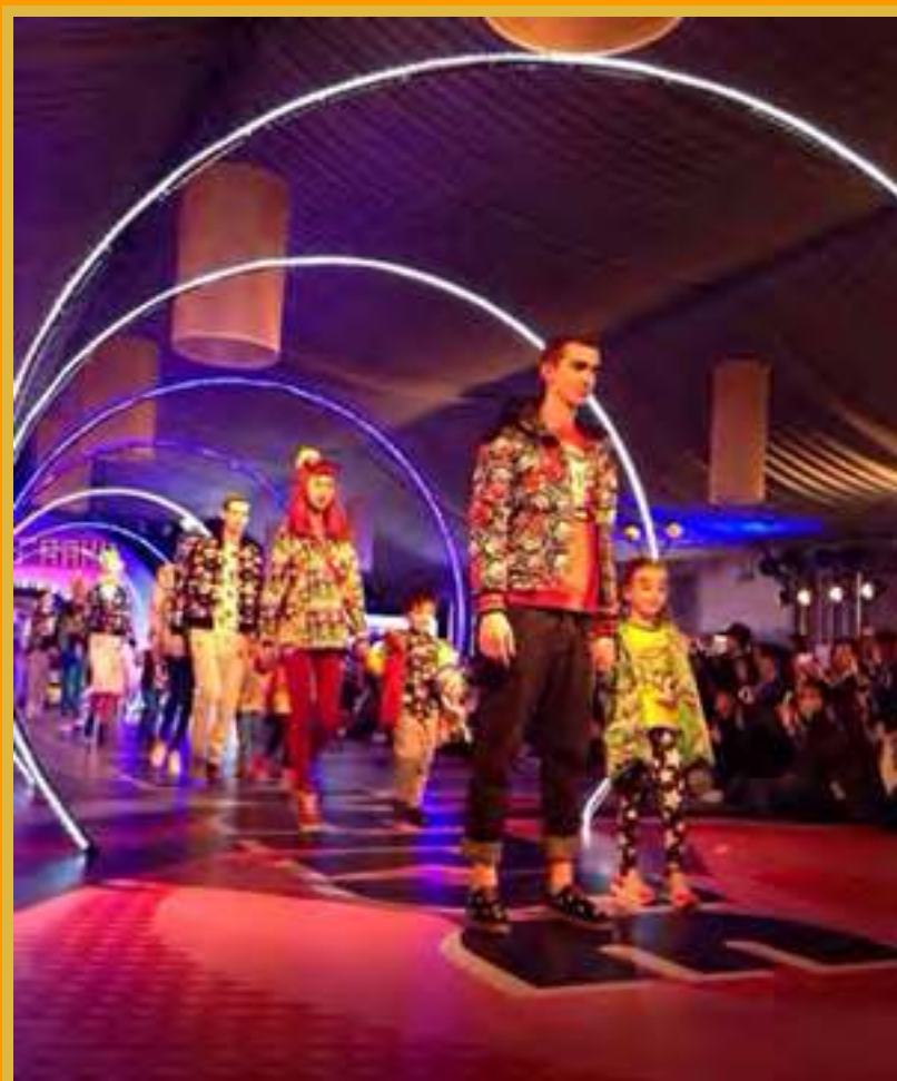
Paul Frank showcases its autumn and winter collection for 2014 at the Millennium Hongqiao Hotel Shanghai.