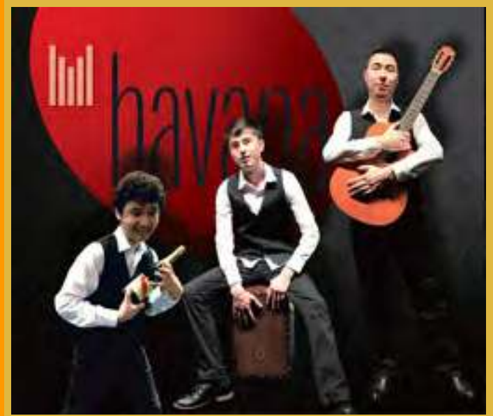
New live band Cubana performs at Havana every Wednesday and Friday night.

Cubana live entertainment starts at 8.30pm and ends at 11.15pm on Wednesdays and Fridays.