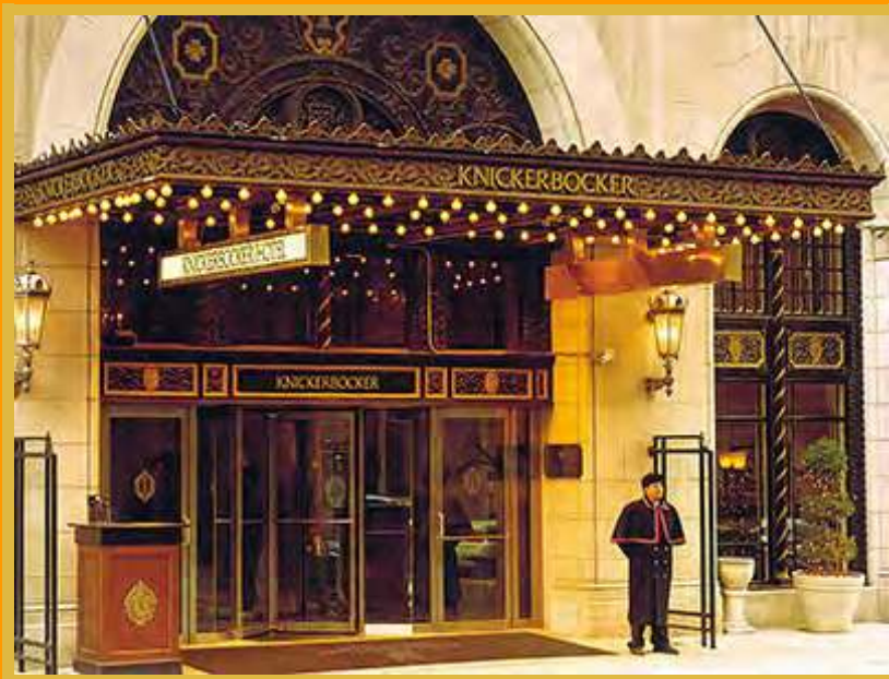
Millennium Knickerbocker Hotel Chicago.

Enjoy double points when you stay at Millennium Knickerbocker Hotel Chicago and receive two complimentary welcome drinks!