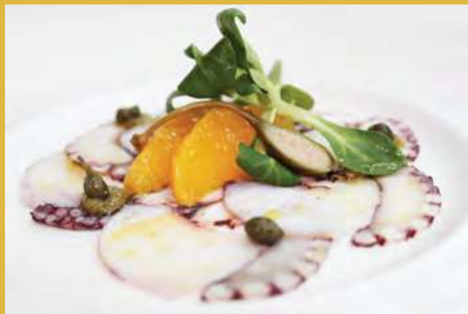
Mediterranean Octopus Carpaccio at Pontini.

Call 6233 1100 or email dining.gcw@millenniumhotels.com