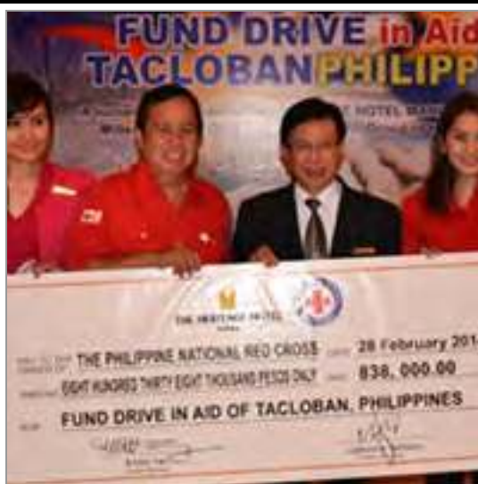
Heritage Hotel Manila Donates To Typhoon Haiyan Victims