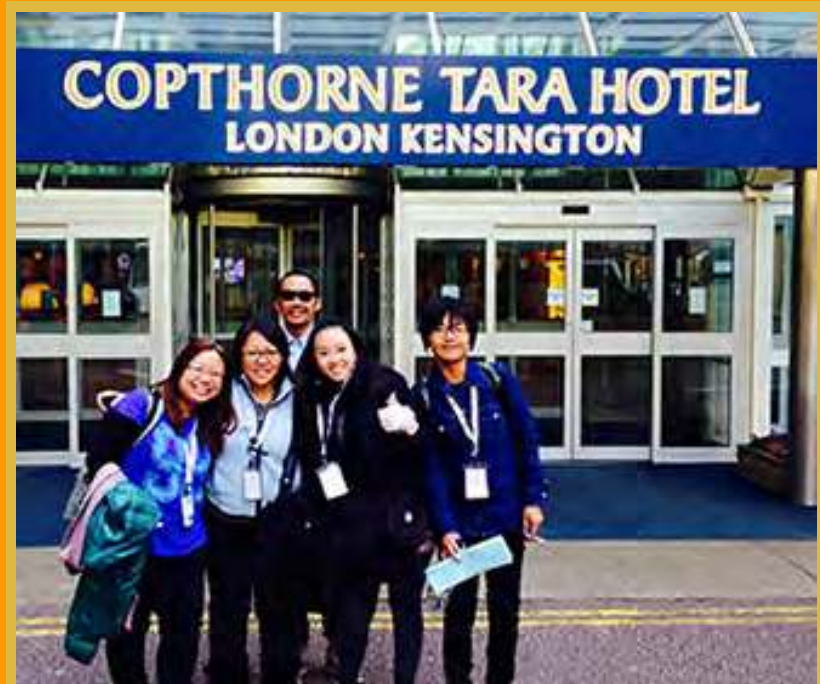
Singapore delegates posing in front of Copthorne Tara hotel.

Singapore Day is a signature event organised by the Overseas Singaporean Unit of the Prime Minister's Office aimed at engaging overseas Singaporeans and their families. Singapore Day 2014, which will be held on March 29 at London's Victoria Park, is expected to attract a turnout of about 10,000 Singaporean families and friends.