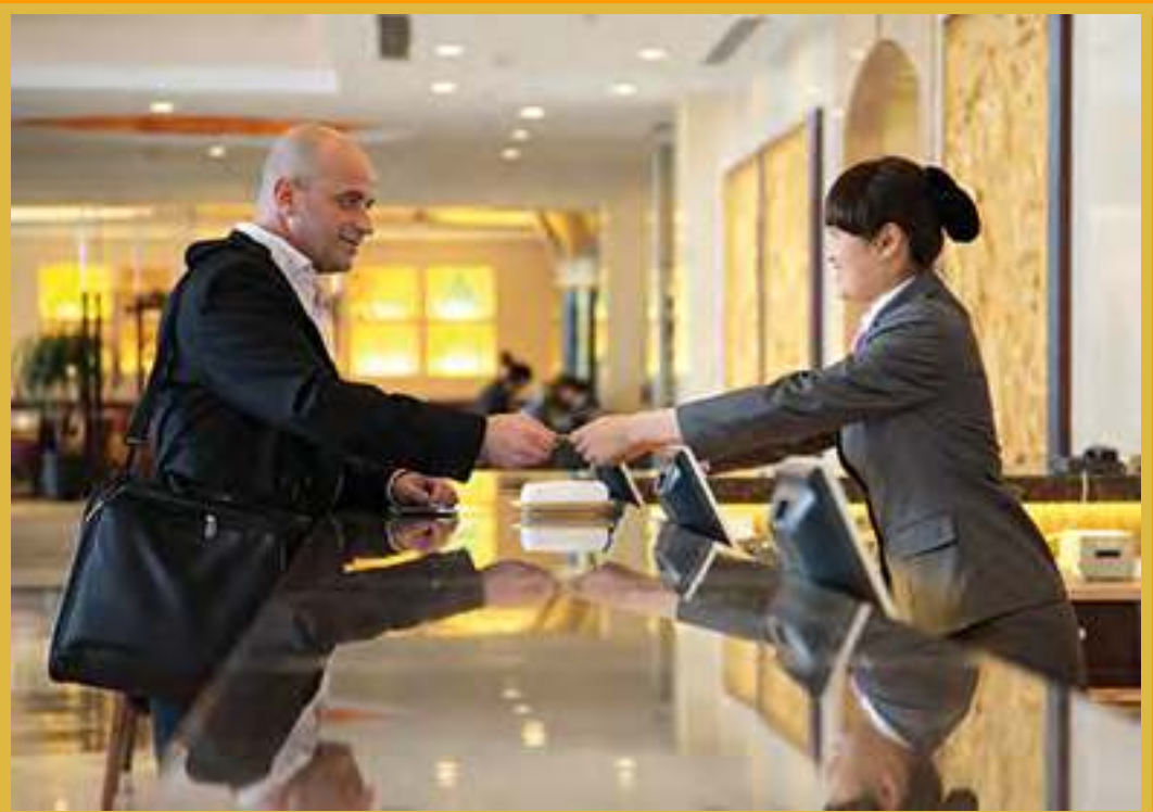
The new central reservation system WindsurferCRS enhance the customer experience for guests when they make bookings at M&C's hotels.

Windsurfer was launched in 2009 and is continuously updated by SHR, which specializes in customer-focused hospitality technology. The system reflects fast-moving trends in both the hospitality industry and in electronic communications, including mobile devices and is ideally suited to a multi-brand environment such as M&C. It provides a seamless, tailored interface with client websites and immense flexibility in accommodating an almost unlimited range of e-commerce initiatives.