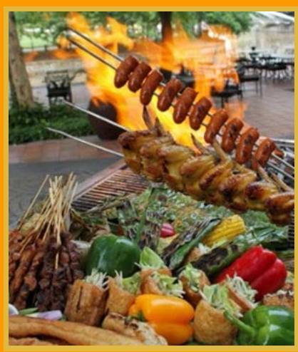
High Tea Barbecue Buffet at Café Brio's

For reservations, please call +65 6233 1100 or email dining.gcw@millenniumhotels.com