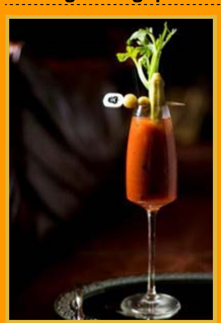
The cocktail Bloody Mary turns 80

Come join The St. Regis Singapore as they celebrate the 80th anniversary of the Bloody Mary cocktail this October.