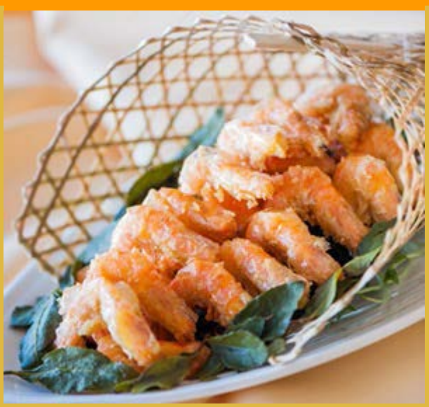
A spread of tea-infused dishes such as Fried Shrimp with Oolong Tea await the healthy food connoisseur at Loong Yuen Chinese Restaurant

This gourmet spread is valid throughout October 2014 lunch and dinner. For reservations, please contact 86 592 2023333-6696 or email fnb@millenniumxiamen.com.