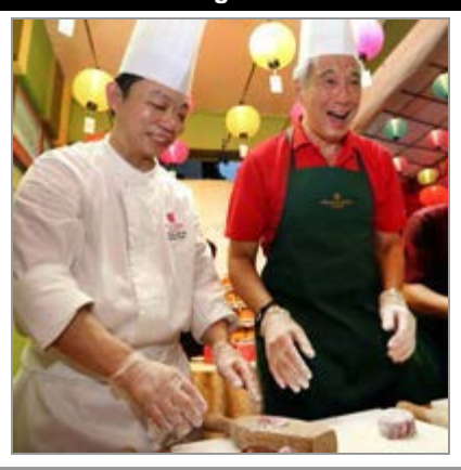
S'pore Premier Lee Makes Light Of Hua Ting Mooncakes