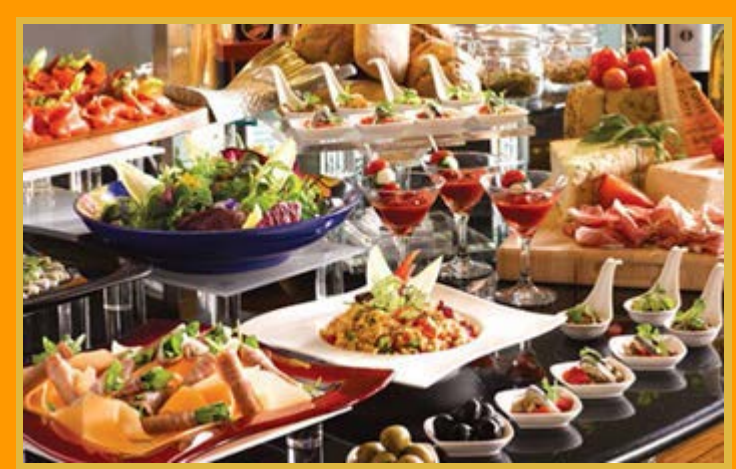
Pontini's first-ever Italian Brunch Buffet

Enrapture Your Senses With Pontini's First-Ever Italian Brunch Buffet