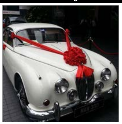
A White Vintage Jaguar For A Wedding Fair