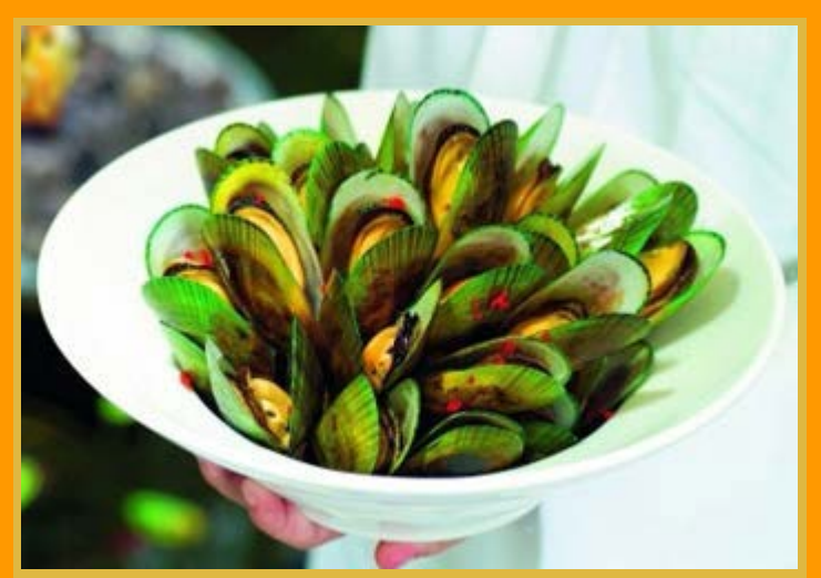
A delightful array of sustainable seafood from New Zealand will be available at the Fish Bar to whet the appetites of all seafood lovers.

The JW culinary team is pleased to introduce a delightful array of quality New Zealand sustainable seafood at the Fish Bar from 9 October to 2 November 2014.