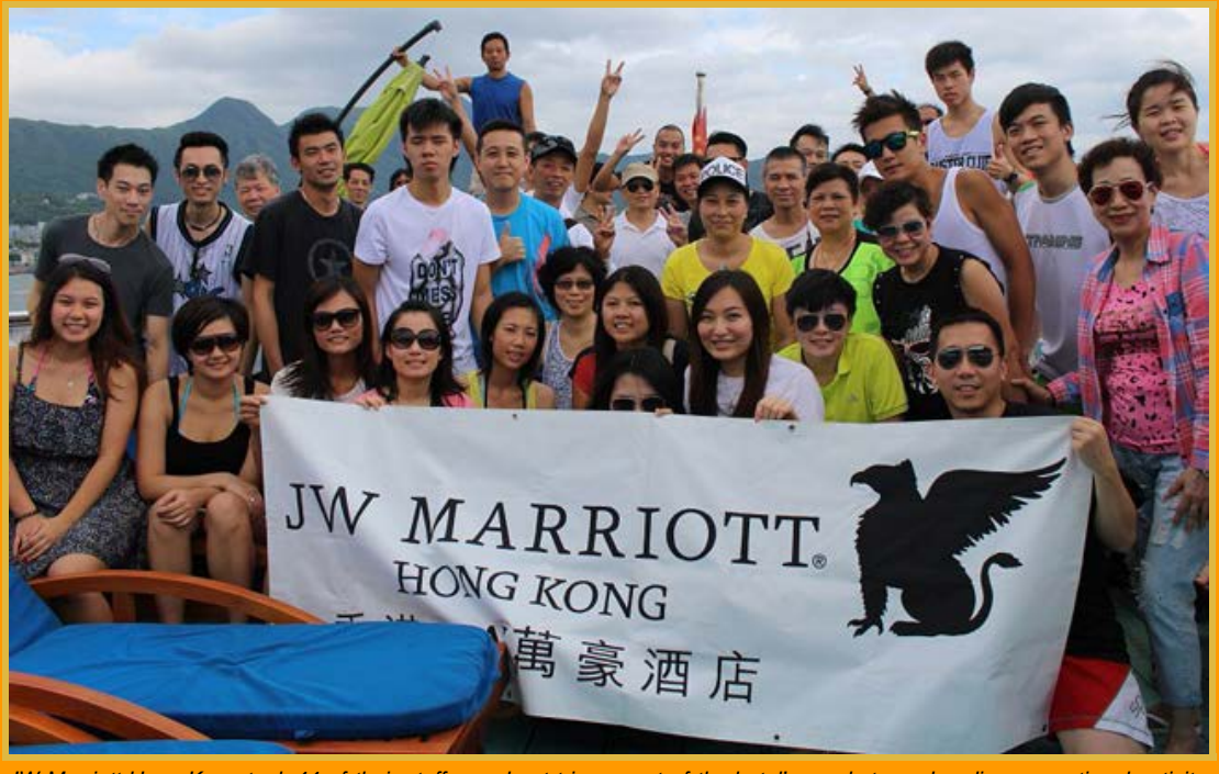
JW Marriott Hong Kong took 44 of their staff on a boat trip as part of the hotel's yearly team-bonding recreational activity.

The rest of the day was spent on the boat playing card games, singing karaoke, sun-bathing and water sports like wakeboarding, banana boat ride, and a thrilling water slide. Everyone had an enjoyable time and it was a perfect end to the amazing summer season.