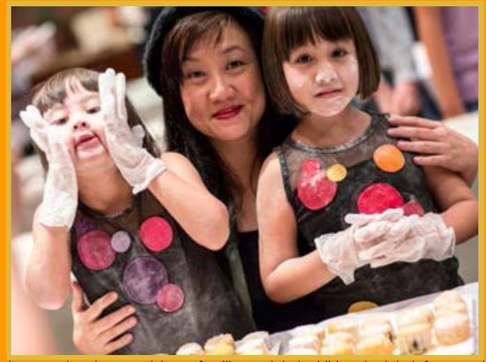
It was a hands-on activity as families and their children had their faces and elbows in flour while making mooncakes.

With the aim of giving back to society in celebration of the upcoming Mid-Autumn Festival, The St. Regis Singapore made contributions to international aid organisation, UNICEF, Check Out for Children (COFC), a Starwood Hotels & Resorts' adopted charity, as well as to more than 250 elderly at local beneficiary NTUC Eldercare Co-op Limited