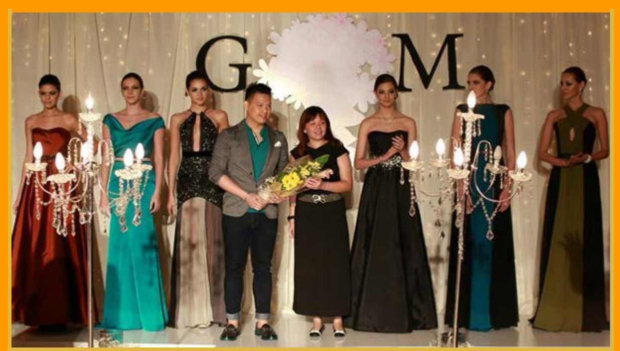
A haute couture fashion show featuring bridal and evening gowns was one of the highlights at Grand Millennium Kuala Lumpur's inaugural wedding fair.