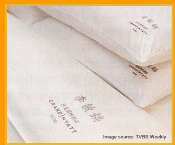
During his stay at the Grand Hyatt Taipei, he was given the royal treatment that includes a Korean-speaking personal butler, as well as personalised bed linens and bathrooms with his name embroidered on them.