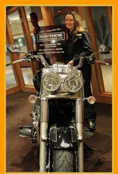
A Copthorne Rotorua staff stands proudly next to a Triumph Motorcycle in the hotel lobby.

Copthorne Rotorua recently hosted The Triumph Riders Motorcycle Show together with The Triumph Riders Motorcycle Club of New Zealand. Triumph Motorcycles is the largest British motorcycle manufacturer, established in 1984.