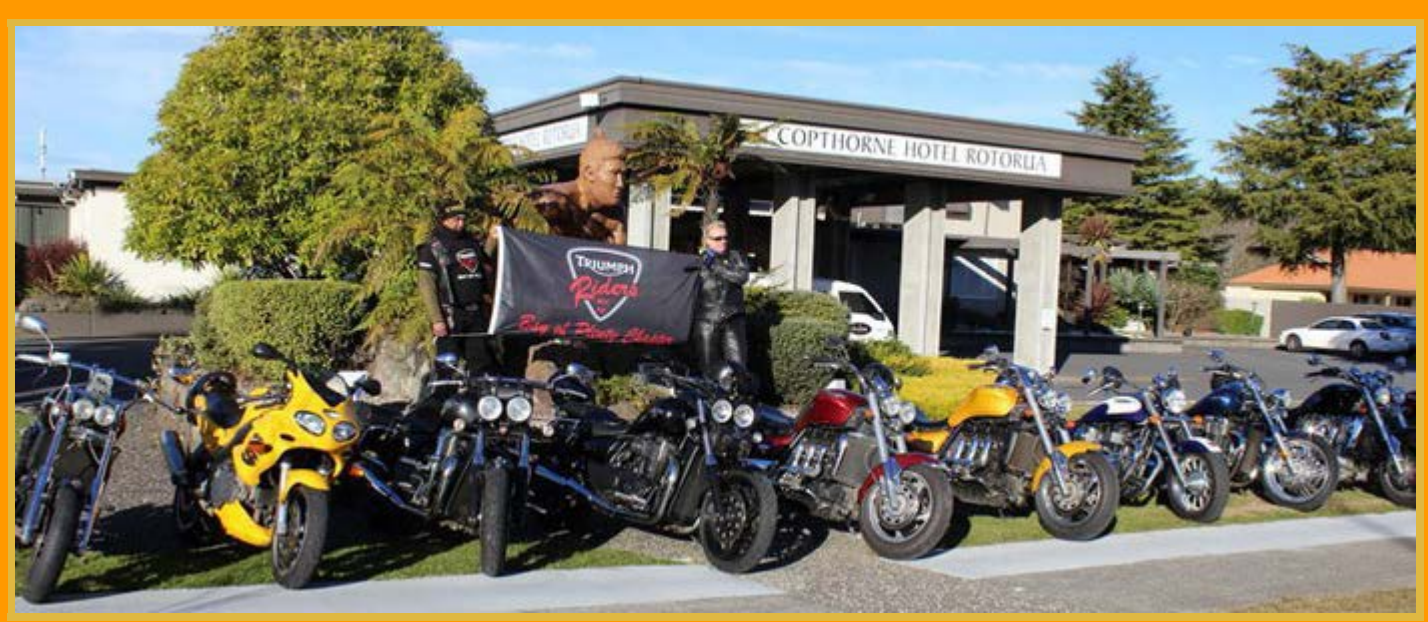
More than 70 Triumph Motorcycles on display at the grounds of Copthorne Rotorua.

The national club has more than 200 members with 20 of them living within the Bay of Plenty.