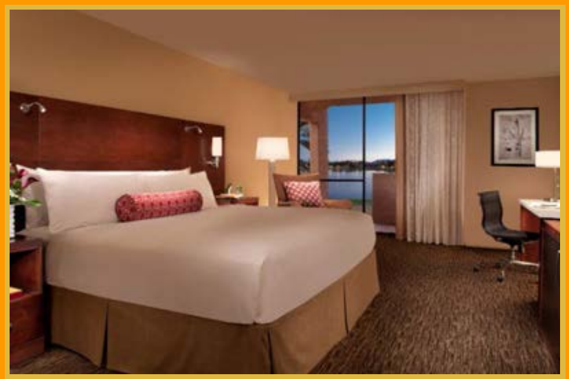
All 125 guest rooms come complete with private balcony or patio, and are renovated in natural tones to reflect a modern and relaxed look.

Formerly the Millennium Resort and Villas Scottsdale, The McCormick Scottsdale has reopened after a six-month renovation. These upgrades come on the heels of renovations to Millennium Harvest House Boulder that was completed in the spring this year, and extensive refurbishments to ONE UN New York and Millennium Hotel Minneapolis in the past two years. These renovations are part of M&C's multi-million dollar investments to upgrade its 14 North American properties.