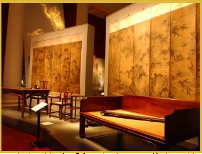
Pictured here is the interior of the existing Kwek Hong Png Gallery which houses regional specialties from Fujian such as longyan wood furniture and the museum's collection of blanc de chine porcelain from Dehua – one of the best in the world.