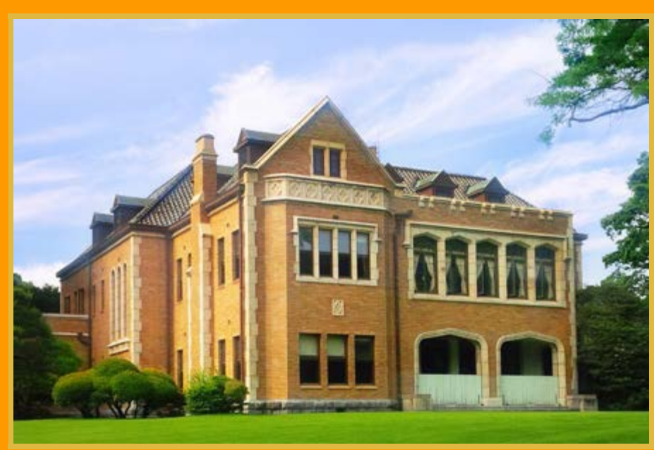
Built in 1933, a historical mansion that used to be the home of Seiko's founder Kintaro Hattori sits on the site in Tokyo that CDL and a US investment firm have purchased.

City Developments Limited (CDL) together with a U.S. based investment firm have acquired, through a jointly established Japanese special purpose company, a prime freehold land site in Tokyo for 30.5 billion yen (approximately $$355.5 million based on an exchange rate of $$1 to 85.8 Japanese Yen) from Seiko Holdings Corporation (Seiko). The acquisition comes on the back of CDL's plan to step up its overseas expansion in real estate development.