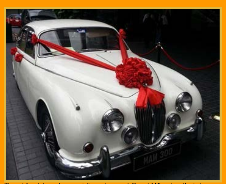
The white vintage Jaguar at the entrance of Grand Millennium Kuala Lumpur, drew much attention from onlookers and passerbys.

Grand Millennium Kuala Lumpur (GMKL) worked with WeddingsMalaysia.com, a one-stop online wedding shop, and hosted its inaugural wedding fair with the theme "Classic Weddings Made Timeless".