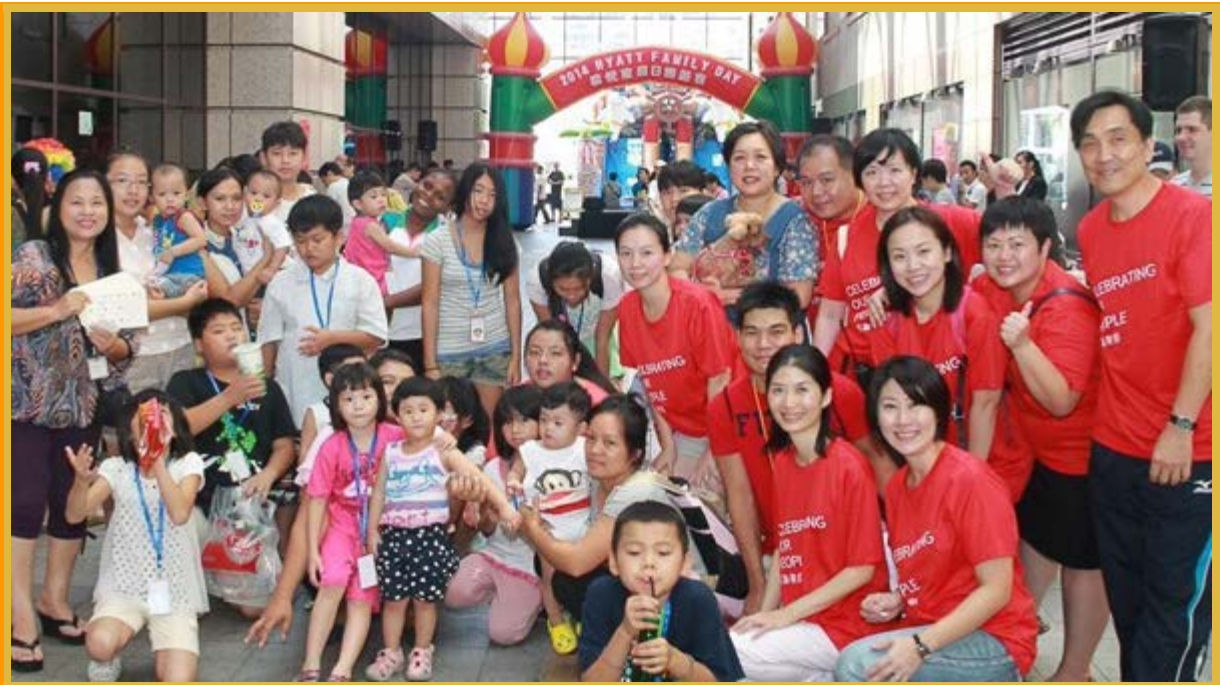
The hotel also held a Family Day that featured carnival-like games and entertainment for staff and their families.