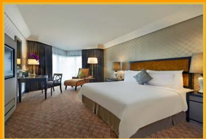
GMKL's Grand Deluxe rooms feature elegant furnishings within expansive living spaces.

Guests will also be able to enjoy floor to ceiling views of the city downtown skylines. The hotel is just a short distance from Kuala Lumpur's famous Petronas Twin Towers, which is connected to the Pavilion Shopping Centre via an air-conditioned walkway.