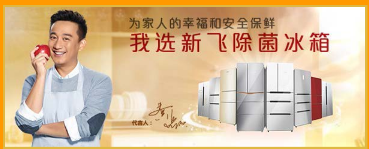
Chinese celebrity and Frestec's brand ambassador Huang Lei promotes the Libra range of anti-bacterial refrigerators.