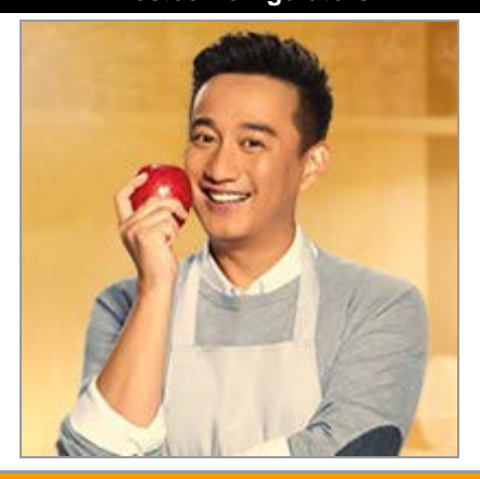
China Celebrity Promotes Frestec Refrigerators