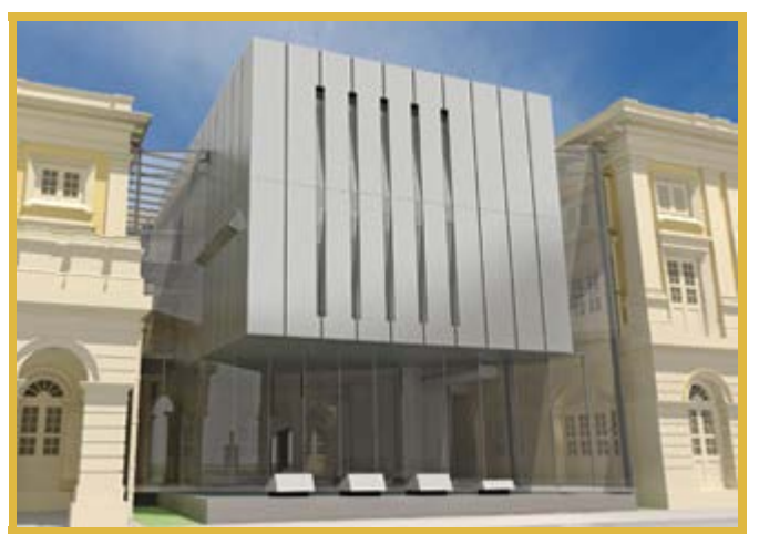
The museum's ongoing revamp includes the expansion of the China Gallery into a 3-level space approximately 900 sqm, adding a new modern wing to the classical frontage of ACM.

Currently undergoing a revamp, ACM will focus on enhancing its building to better promote greater cultural understanding among different communities. The museum will also focus on enhancing its building to increase its accessibility to the general public.