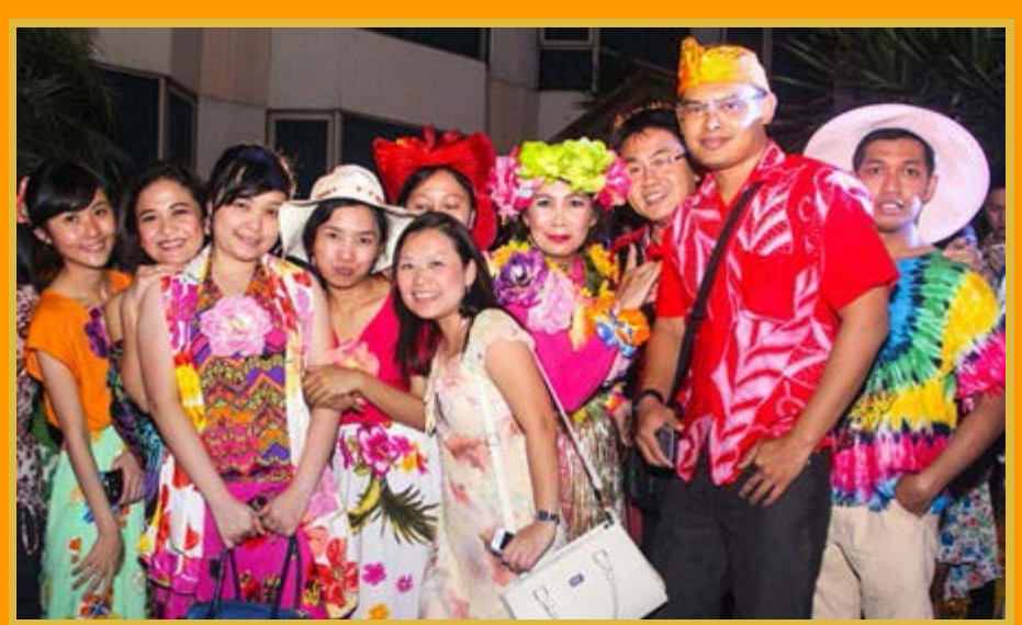
Millennium Sirih Jakarta held a Hawaiian-themed birthday bash that saw a turnout of more than 150 guests from the corporate and media industry.

Millennium Sirih Jakarta held a Media & Corporate Gathering to celebrate its 20th birthday which was successfully held at the hotel's Pool & Sky Garden on August 29, 2014. The event was attended by over 150 invited guests from the Corporate and Media.