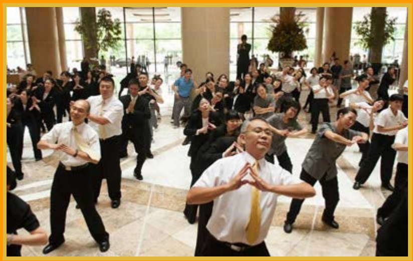
More than 240 employees of Grand Hyatt Taipei came together in a flash-mob boogie as part of the hotel's 24th anniversary celebration.

The hotel recently emerged from a two-year room renovation project that stripped all 853 rooms and