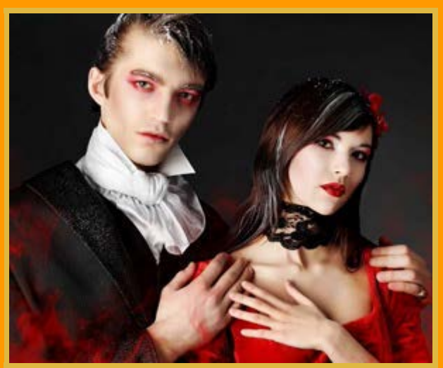
Come clad in your spookiest costume and celebrate Halloween at Connections.

For enquiries and reservations, please call +65 6318 3161 or email connections@millenniumhotels.com.