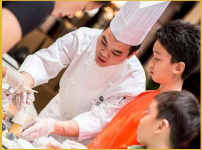
Children gazed in awe as a St. Regis Chef taught them the intricate art of