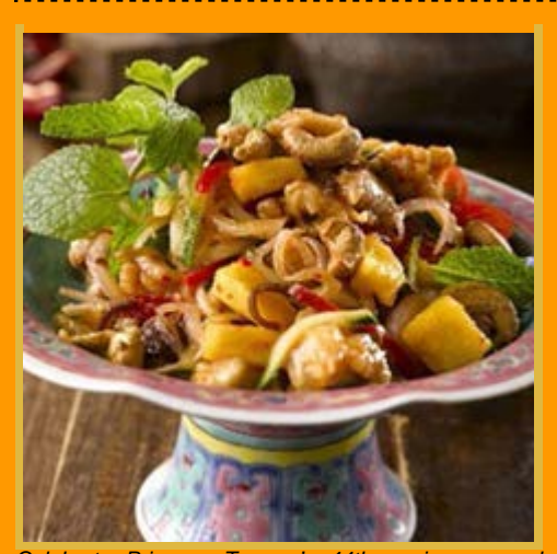
Celebrate Princess Terrace's 44th anniversary and pay $$4.40 when you dine with 2 other paying adults.