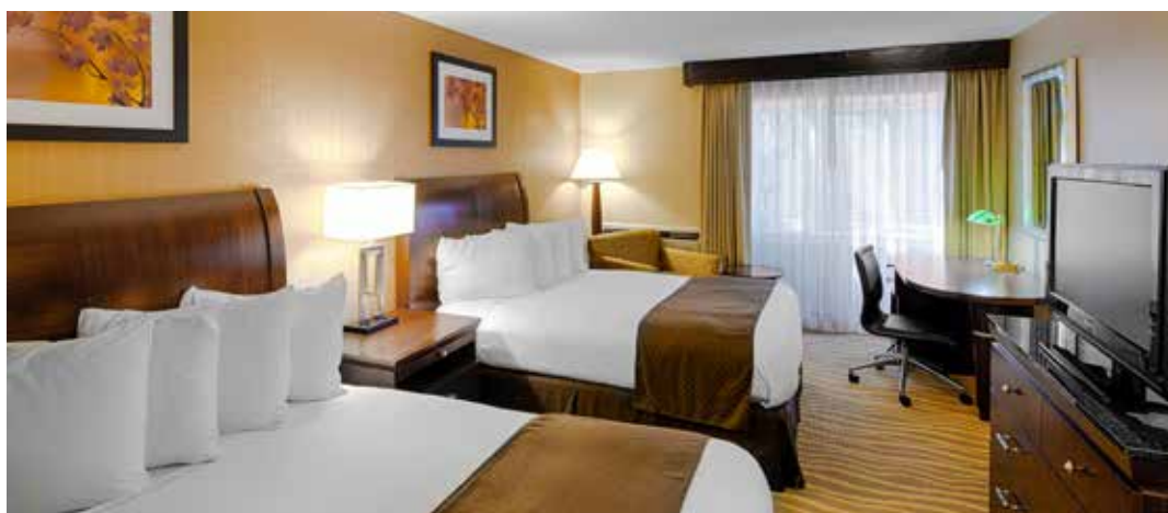
DoubleTree by Hilton Burlington, South Burlington, VT, USA