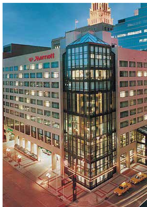
Rochester Marriott Mayo Clinic Area, Rochester, MN, USA

The Group has a competitive wage and benefits package which are critical to maintaining a level of consistent and quality services.