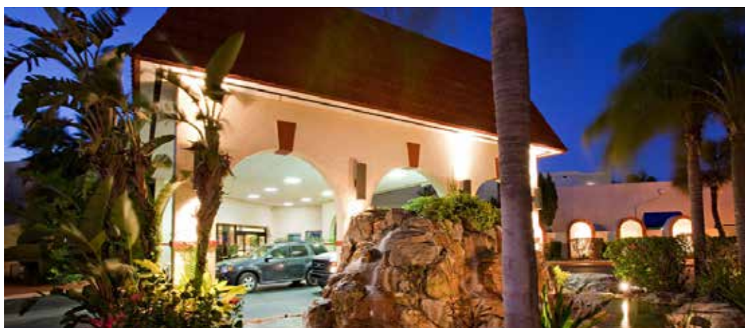
Maingate Lakeside Resort, Kissimmee, FL, USA