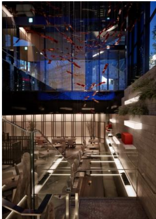
Caption: Large mural artwork and special carpet design complete the idea of the private garden throughout the hotel (above left photo) while landscape stairs connect the lobby to the restaurant in the lower ground level (above right photo).