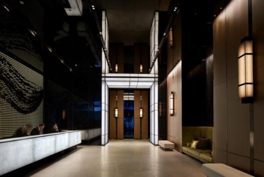
Caption: The design concept of Asian Minimalism continues the hotel reception where lighting, touch, texture and comfort are all carefully considered in the development of the concept.