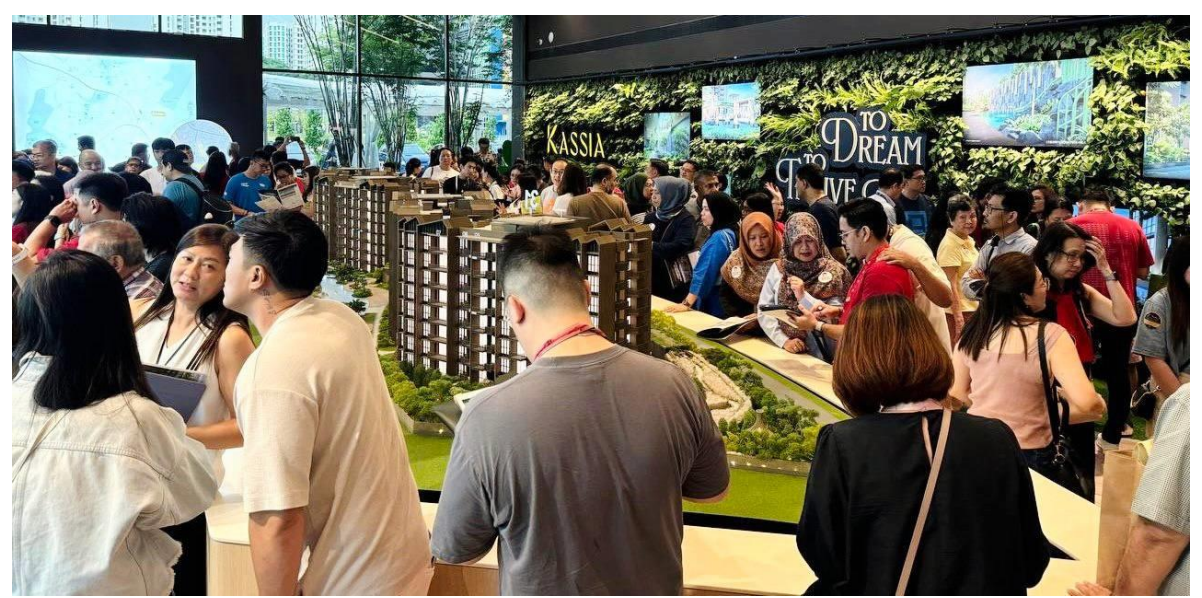
Kassia, Tripartite Developers' final new launch in Flora Drive, saw strong interest during its 2-week preview.

Singapore , 21 July 2024 – As at 5pm today, Tripartite Developers sold 144 units or 52% of the 276-unit freehold Kassia. Tripartite is a joint venture comprising Hong Leong Holdings Limited, City Developments Limited, and TID Pte. Ltd.