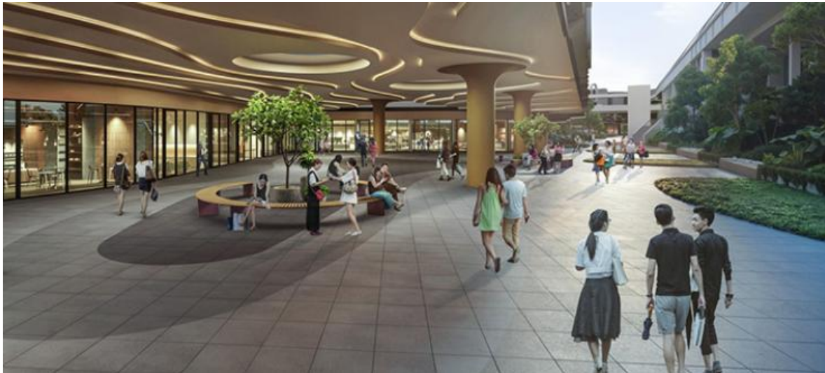
Spanning 32,292 sq ft on the first floor, the commercial podium is accessible via the upcoming Hong Kah MRT and will offer F&B outlets along other retail services. (Artist's impression)

Tengah Garden Residences offers side-gate access to a nearby bus stop and taxi stand, as well as the upcoming Hong Kah MRT station on the Jurong Region Line, providing direct connectivity to the western region and Jurong Lake District.