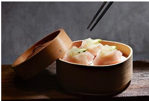
Delight in refined Cantonese cuisine with exquisite dim sum, premium seafood, and signature classics.

Renowned for its culinary excellence, Hua Ting Restaurant presents its $78 per person Award-Winning Chef Tasting Lunch Menu (4 March – 30 April 2026)—an elegant showcase of authentic Cantonese cuisine.