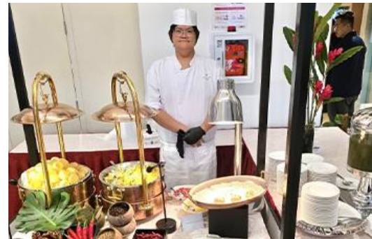
The Pana Purri, a popular Indian street snack, was among the items popular with the guests.