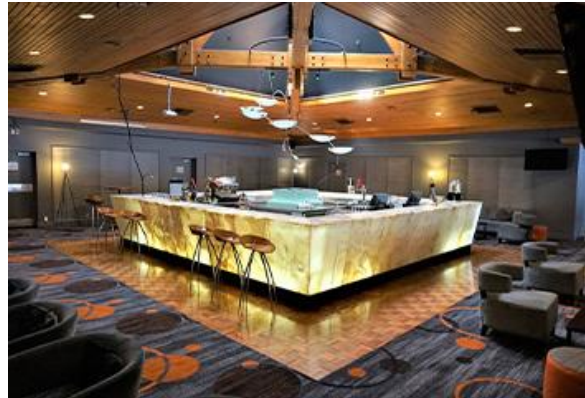
Bar Zazu combines a tempting snack menu with restaurant dining, offering one of Rotorua's top venues for drinks and socialising.

For corporate groups and conference delegates, the hotel's refreshed spaces offer a modern, welcoming environment, with eight flexible spaces suitable for groups of up to 350 people.