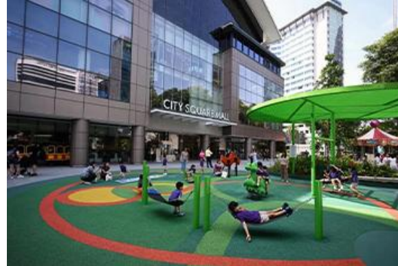
City Green, a 49,000 sq ft urban park features two playgrounds and plenty of landscaped communal areas.

Staying true to its identity as Singapore's first eco-mall, sustainability remains central to the upgrade. Upcycled materials including bamboo chopsticks, bubble wrap and PET bottles, were made into interior wall claddings, while old handrails were repurposed into benches and featured walls.