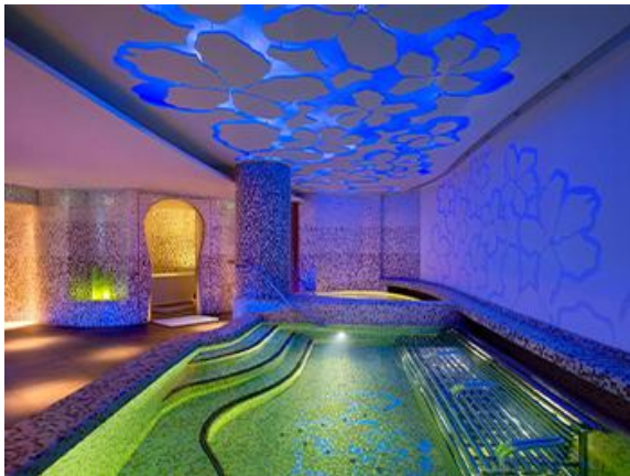
The redesigned AWAY Spa is reimagined as a rainforest-inspired wellness sanctuary, featuring steam rooms, ice baths, infrared therapy, a vitality pool and experiential showers.

Wellness and dining facilities have been upgraded to support evolving guest preferences. The AWAY Spa now includes expanded treatment and hydrotherapy offerings, while signature restaurant SKIRT continues to focus on premium meat and seafood concepts. WOOBAR has been enhanced as a key social venue, supported by an expanded programming calendar including curated lifestyle and sustainability-focused activities.