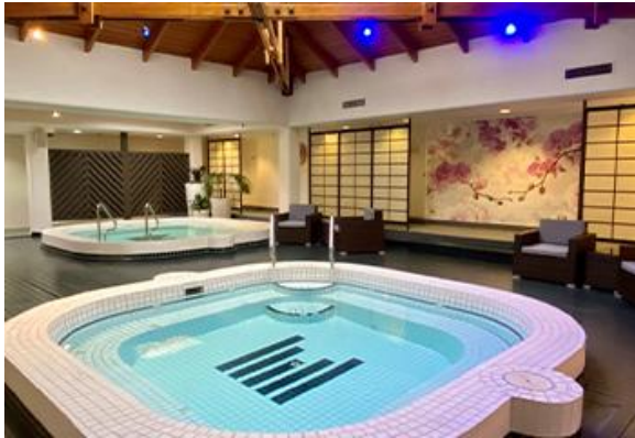
Located within the hotel, the newly refurbished health and wellness spa offers facials, massages, body treatments, and wading pools for a relaxing retreat.

“Our in-house spa, Zazu lounge bar, and Nikau restaurant come together to deliver a cohesive, upscale offering that strengthens our ability to provide the warm, welcoming stays we are known for,” Whiston concluded.