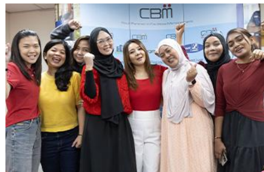
Women at CBM play a vital role in shaping the organisation's dynamic and collaborative culture. The appreciation event captures the team's energy and shared commitment that drives CBM's workplace forward.

At CDL, this commitment is reflected in both representation and culture. Women make up 68% of its Singapore workforce, reflecting the strong presence of female talent in the company generation. Their stories underscore the importance of strong support systems, self-belief, and the confidence to step forward and grow.