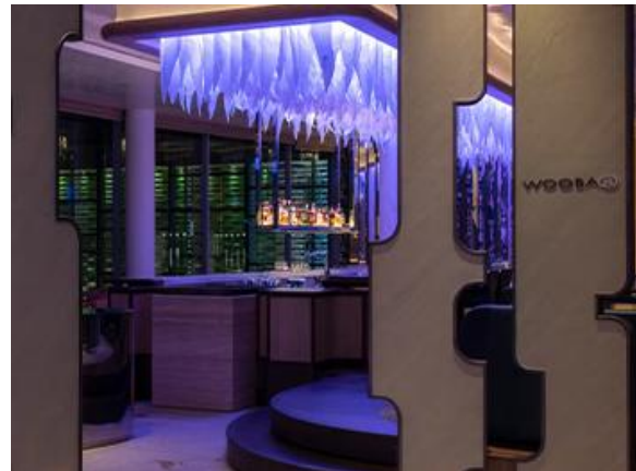
For cocktails and nightlife, the WOOBAR offers inventive mixology, live music, and a lively social atmosphere that embodies the playful energy of the W brand.