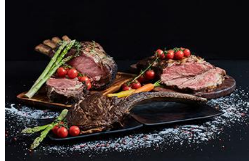
Savour premium Australian meats, hearty soups, and decadent desserts from paddock to plate at Orchard Café.

Available from 4 March to 30 April 2026, the buffet is priced during weekdays at $90 (lunch) and $104 (dinner). Weekends are $100 (lunch) and $114 (dinner).