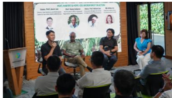
The Singapore Sustainability Academy was packed with over 120 participants from the sustainability community gathering to learn about the first-year findings of the CDL MicroForest in cooling urban spaces and enhancing biodiversity.