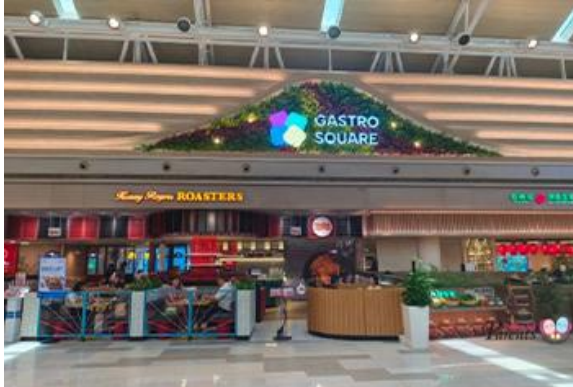
Designed as more than just a dining destination, Gastro Square also hosts a variety of events, workshops, and singing performances to create a lively space.