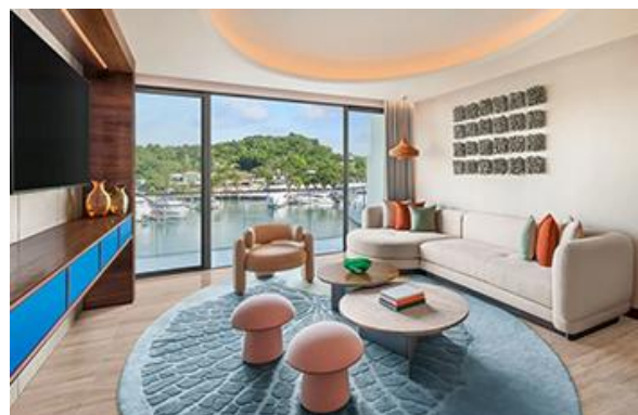
All guestrooms have been redesigned with updated interiors with organic shapes, marina blues and warm wood tones inspired by the surrounding marina and tropical landscape at Sentosa island. Pictured is the Premiere Deluxe King room (left) and a suite with its separate living room (right).