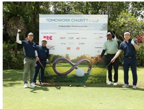
Management and staff from CBM Pte Ltd, Island Concrete (Private) Limited and China Yuchai International.