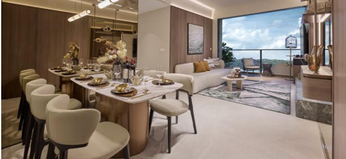
All units showcase clean lines and layered finishes, creating refined interiors where natural light fills the living and dining spaces, harmonizing comfort and elegance. Pictured is the 3-bedroom living and dining area.

The first-floor commercial podium spans over 32,000 sq ft, featuring F&B outlets and retail stores. Residents can enjoy two clubhouses, a gym, function rooms, a children's play zone, and multiple sports and recreational amenities. Nearby retail malls like JEM, Westgate, and IMM provide convenient shopping and dining options, while the area is home to educational institutions such as the upcoming Anglo-Chinese Primary School, Princess Elizabeth Primary School, Swiss Cottage Secondary School, and Nanyang Technological University.